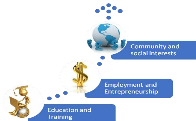
Fig. 1 The main actions of the Europe 2020 strategy for innovative potential growth