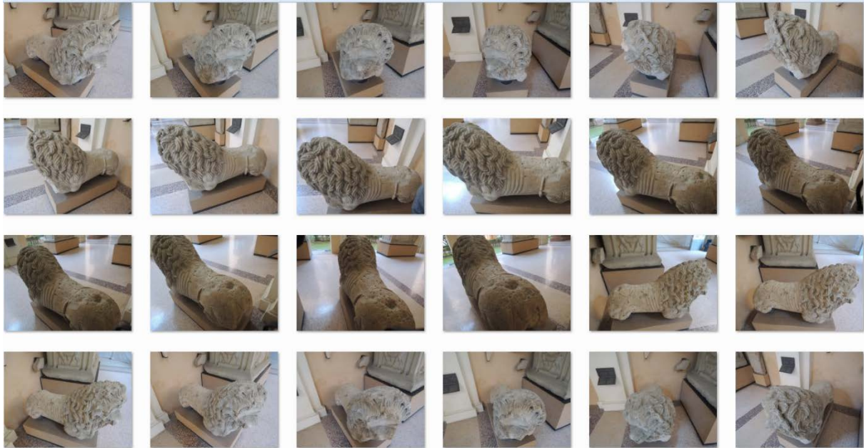
Figure 2. Examples of the photographic images used as inputs for the photogrammetric reconstruction.

achieved model, we further reconstruct the 3D model within the professional software PhotoScan (Agisoft) by means of 130 photos, which generates a more detailed textured model of the lion (Fig. 3), in particular in its back and bottom side.