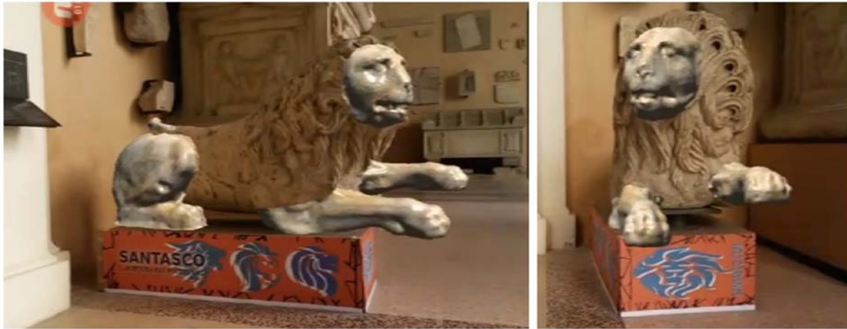
Figure 7. Augmented Reality scene of the lion in crouching position.