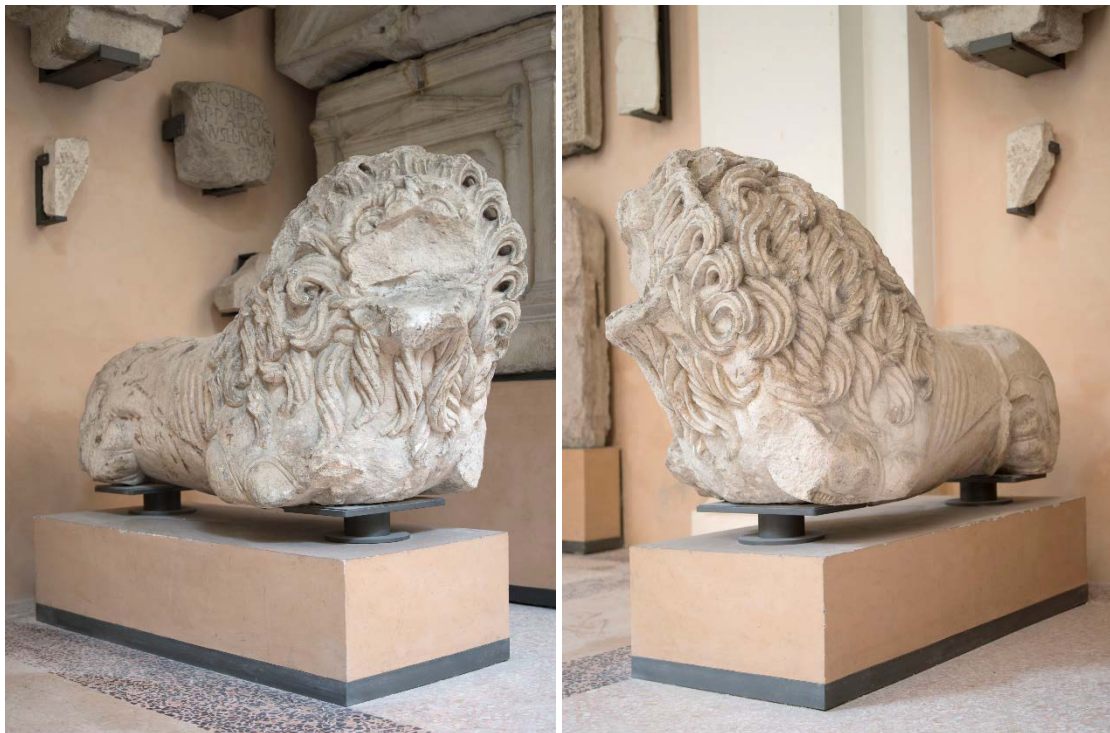
Figure 1. The funerary lion statue (first half of the 1 st century CE, Museo Lapidario Estense, Modena, Italy).

Sculptures of this kind were widely used in Roman funerary structures of the Augustean era, similar elements are linked to other monuments such as the contemporary ones of Aquileia (Udine, Italy) and Sepino (Campobasso, Italy). The statue of this lion should have three other similar sculptures, placed in guardianship of a monumental sepulcher that had to rise along the ancient consular road “via Aemilia”. Monuments of this type and size had to be very common in Modena, as in the case of the two Roman lions on the sides of the main door of the Cathedral (Duomo) of Modena (see next sub-section).