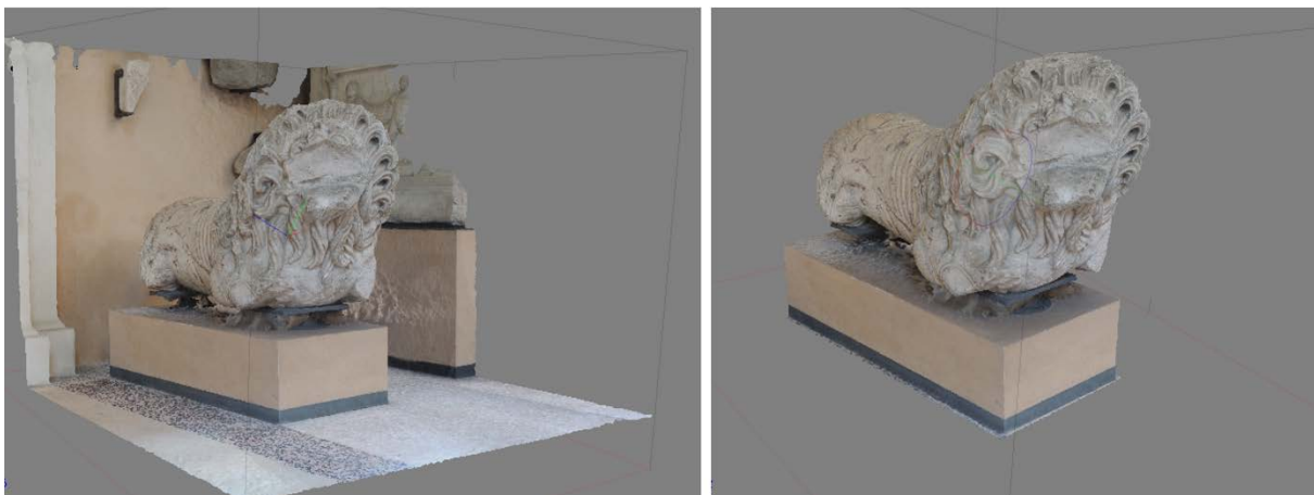
Figure 3. Digital model reconstruction: (left) the model as output from the software PhotoScan (Agisoft) and (right) after removing the background scene.

Similarly, we reconstruct: 1) the right one of the two Roman lions of the main door of the Cathedral of Modena (Fig. 4a), which are considered of the same age and originally with the same function (i.e. funerary lions), but re-used as building materials during the Cathedral of Modena construction [11,12]; 2) a crouching funerary lion of the 2 nd Century CE (Fig. 4b), kept in the Capitoline Museum of Rome (Italy) [13], in order to extract some details.