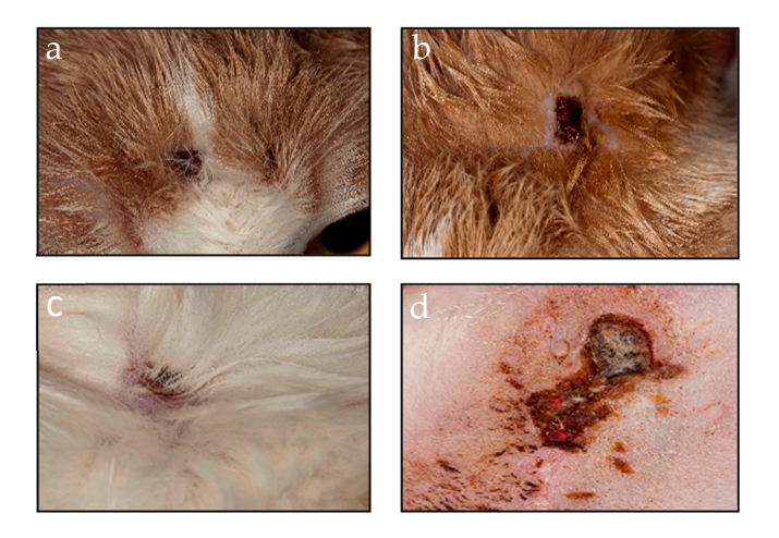
Figure 1. Clinical of the Orthopoxvirus (OPV)-infected cat. Skin lesions on the numerous vesicles spread on the muzzle ( a ), head ( b ), back ( c ) and in the mammary area ( d ) of the sick cat.

In February 2011, a sick cat with skin lesions suggestive of OPV infection was observed at a veterinary clinic located in Fagagna, FVG. The lesions, that had appeared one week before the visit, healed about 10 days after the visit (Figure 1); overall, the disease course appeared to be mild, and the cat recovered completely without sequelae.