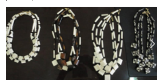
Figure 1. Sample jewellery made out of bones and bars of soap produced from tallow

Export of livestock and livestock products is the main source of foreign currency earning in Somaliland. However, in the recent past, the growth in earnings from livestock sales has been declining against a background of increasing human population growth. Adding value to livestock and livestock products provides an avenue for reversing declining growth in incomes.