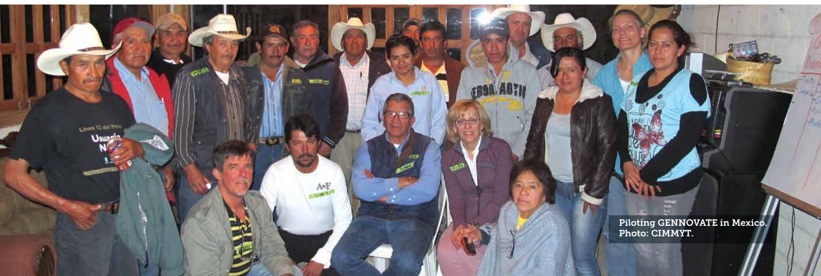
Piloting GENNOVATE in Mexico.

Due to the comparative nature of the study, PIs were very interested in sharing their own teams' data. At the same time, they wanted to maintain control over the data and its interpretations and give/receive credit where it was due. To address these and other concerns regarding data sharing, a joint collaboration agreement (available upon request) was established and formalized. This included data sharing and authorship principles and procedures aligned with CGIAR and donor standards. It was agreed that using the data of another PI would entail joint authorship of the research output, unless the PI who oversaw the case chose to decline authorship. This was done to recognize the PI's work in the shared case study and to validate interpretations of the data with the PI's knowledge of the context for the case at hand. Data management rules were established. For example, all data had to be safeguarded confidentially by the center with which its PI is affiliated, and access to data collected by PIs from other Centers had to be formally documented using the GENNOVATE data-sharing agreement and template (available upon request) with clear indication of the specific purpose for which data access was being granted.