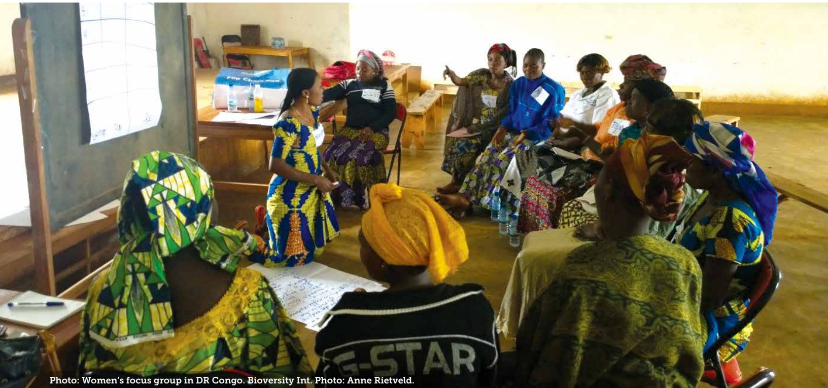
Photo: Women's focus group in DR Congo.

“GENNOVATE: Enabling gender equality in agricultural and environmental innovation” is a collaborative study that represents an unprecedented initiative in the CGIAR in its scale and comprehensiveness for examining gender norms, agency, and capacities for innovations. A qualitative study, it brings to life the voices, challenges, and aspirations of local people differentiated by gender, socioeconomic class, and generation under diverse cultures, religions, ecological circumstances, and agricultural systems. The research design was developed collaboratively, and Principal Investigators (PIs) from