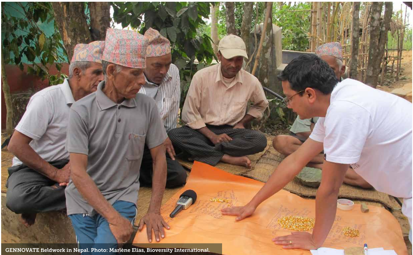
GENNOVATE fieldwork in Nepal.