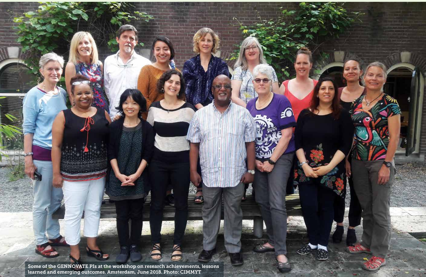
Some of the GENNOVATE PIs at the workshop on research achievements, lessons learned and emerging outcomes. Amsterdam, June 2018.

This publication was made possible by the support of the Bill & Melinda Gates Foundation.