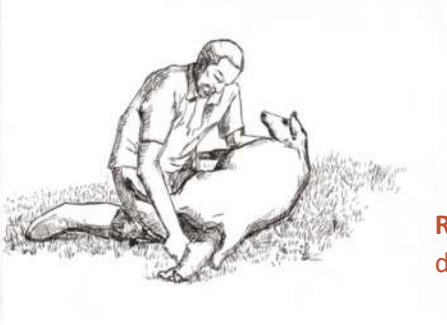
Risk: assisting animals during delivery