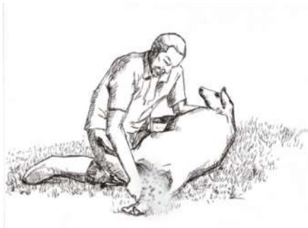
Risk: assisting during delivery