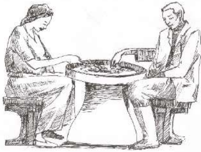
Risk: eating of contaminated food