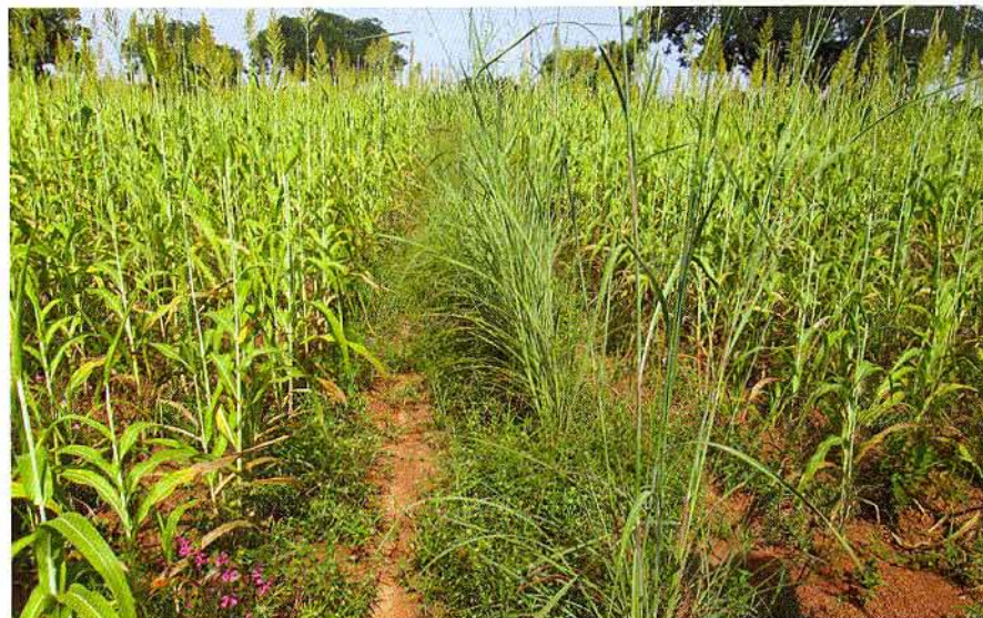
Andropogon Grass growing in between sorghum fields