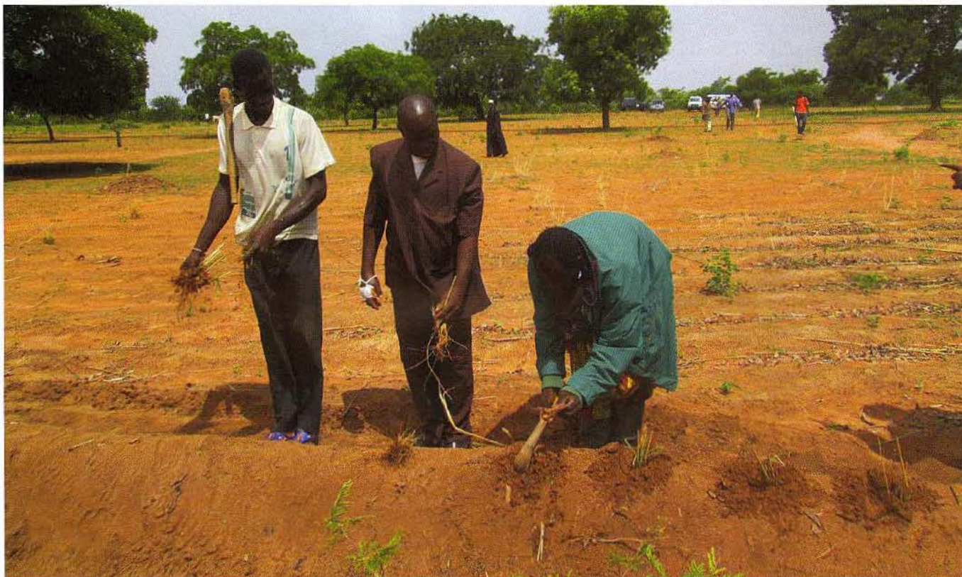
Farmers planting Andropogon grass on contour bunds