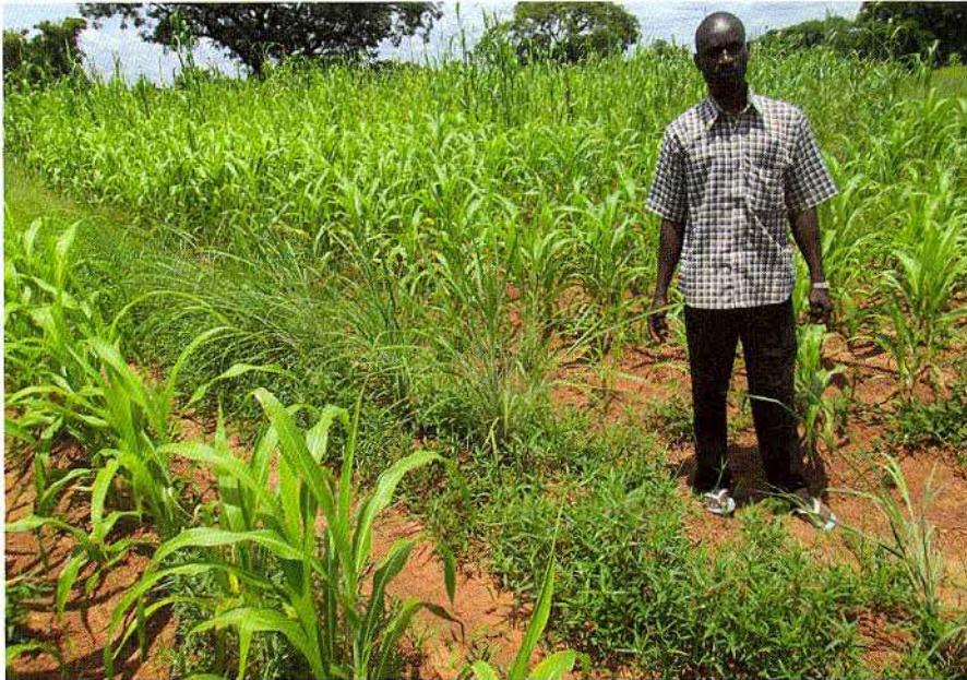
Maize field in a constructed ACN and Andropogon