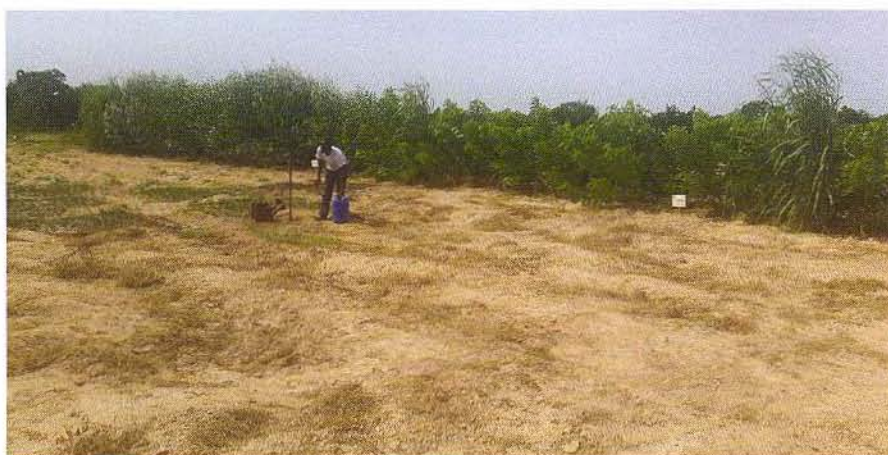
One Year old Andropogon grass and other tree species planted on crest of contour.

Says Dr Birhanu Zemadim Birhanu, Senior Scientist, ICRISAT who led the study, "We need to balance natural resource use. Areas that were natural forests have been converted into agricultural land without increase in crop yields per unit area. Contour bunding, a low-cost technique has dual benefits of