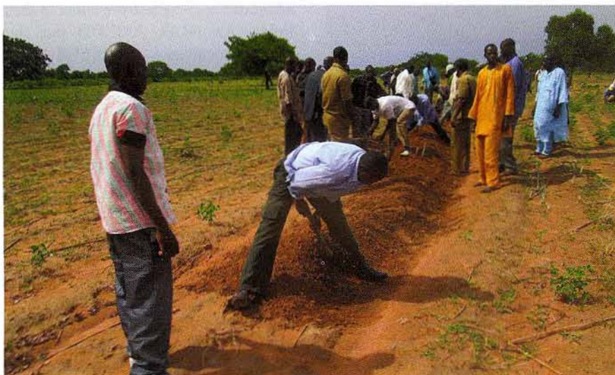
Farmers in Kali village in a collective effort to make contour bunds

For more information contact ICRISAT – Mali, BP 320 Bamako, Mali. Tel: +(223) 20 70 92 00; Fax: +(223) 20 70 92 01; Email: Icrisat.Mali@cgiar.org ; Web: www.icrisat.org