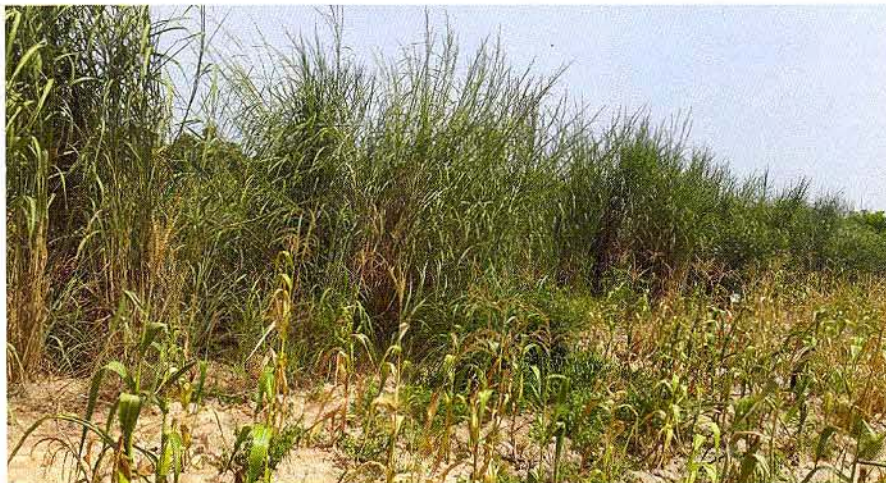
One Year old Andropogon grass planted on crest of contour