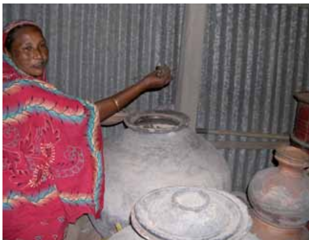
Storing rice seed in a pot, with neem leaves. Similar innovations have been shared across Africa on video.

In 2002–2004 extension agents, media, project and programme implementers showed interest in using the videos when they were made available by the project (PETRRR – Poverty Elimination through Rice Research Assistance), which I helped to manage.