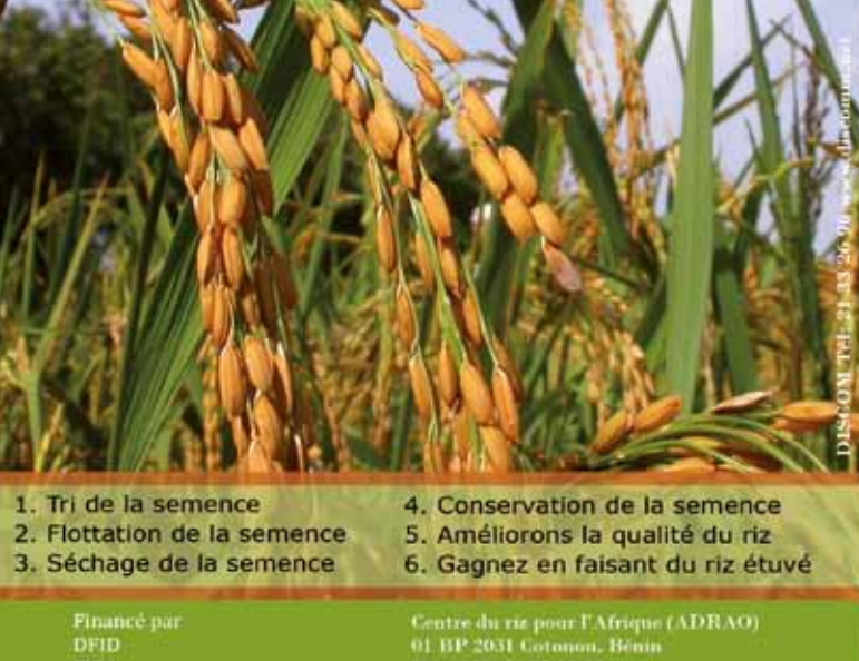
DISCOVER THE SEEDS OF YOUR FUTURE