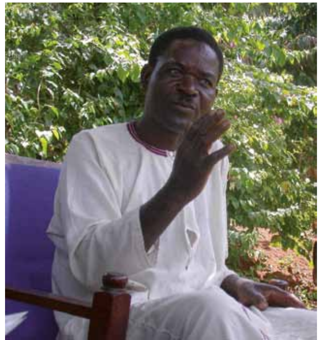
Not everyone interviewed is suitable for inclusion in the final edit of the video.