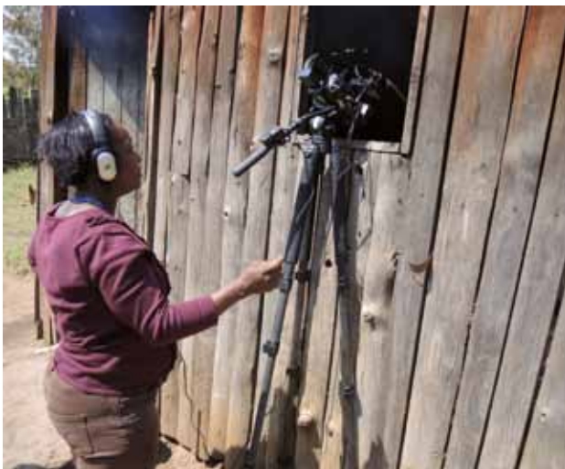
Motivation matters. Different people have their own reasons for wanting to help make a video.