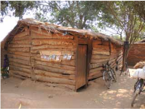
In Uganda some kibandas or video shacks have started showing farmer training videos, not just football games.

Others added that during the video show, more entertainment takes place and less learning. The farmers were watching the attractive pictures, but not learning much. This was partly because the videos were shown so late at night, when the farmers were too tired to pay attention.