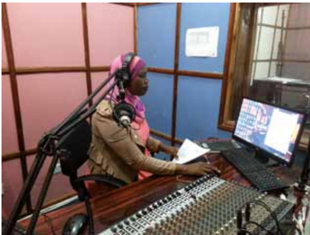
Rural radio broadcasters learn from training videos to make interesting radio programmes.

pre-loaded farmer training videos in Chichewa from Access Agriculture.