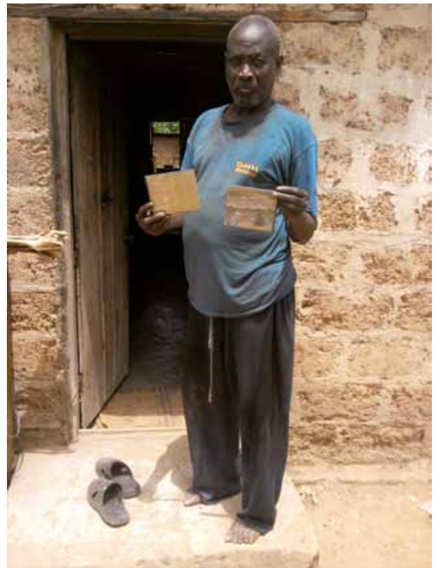
Take care of precious objects, including DVDs—it may not be possible to replace them.