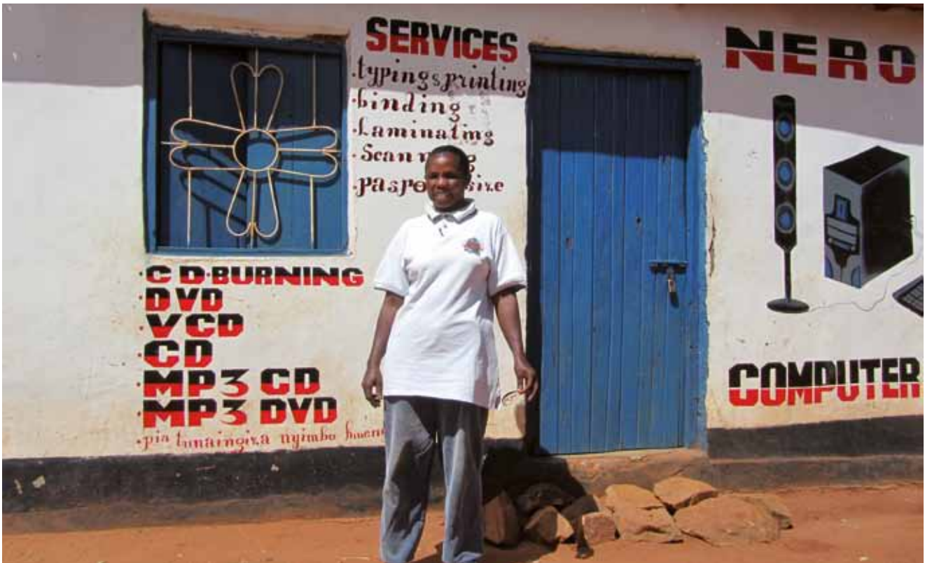
While digital technology gets cheaper and more common, if people are going to watch the videos, the content must still be relevant, and of high quality.

For example, while I was training farmers who are poultry cooperative board members in Siaya County on cooperative management, I showed them a video on poultry management. Most of them liked the video and asked where they could get the video to watch later.