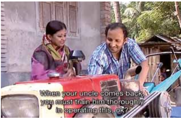
Spicing the message up with a bit of light drama.

In another video, we tackle how important it is to harvest rice quickly so that the subsequent wheat crop can be planted on time to achieve higher yields. Farmers however face difficulty in timely harvesting because of the heavy labour burden of hand cutting their fields, not to mention the hard work. We therefore developed a story about Kashem. His wife Mina finds him relaxing at home, rather than harvesting rice. She is worried they won't be able to plant wheat on time.