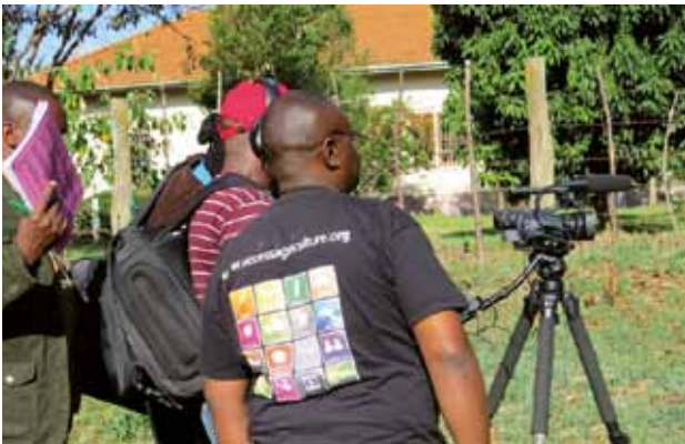
University students learn about filming and farming by making a video with a community.

When we finish the videos we return to the communities to share the videos with the farmers, who are delighted to see the videos. The farmers seem excited and they relate with the innovations presented in