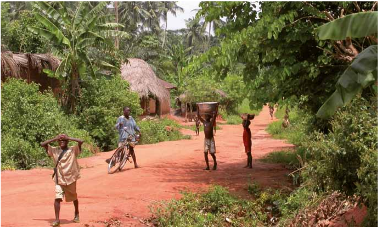
Farmers are willing to pay to watch videos and children are eager to attend public video shows

wanted to watch other videos on rice and chillies. How can we fulfil the farmers' wish? Could farmers buy the DVDs and watch them on their own in small groups? Could the lead farmers create video clubs to screen videos?