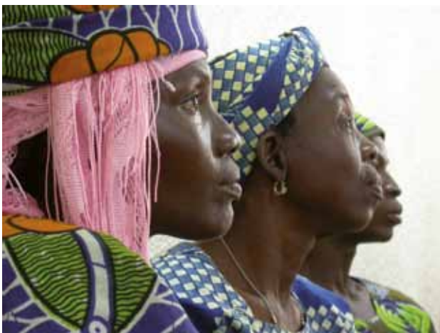
A farmer is much more interested in watching and sharing a video if it is in her own language.

Videos to train farmers are a success if farmers receive the message and remember it. In Benin in 2007, the French versions of some videos on rice growing were introduced via public video viewings and also on DVDs given to farmers.