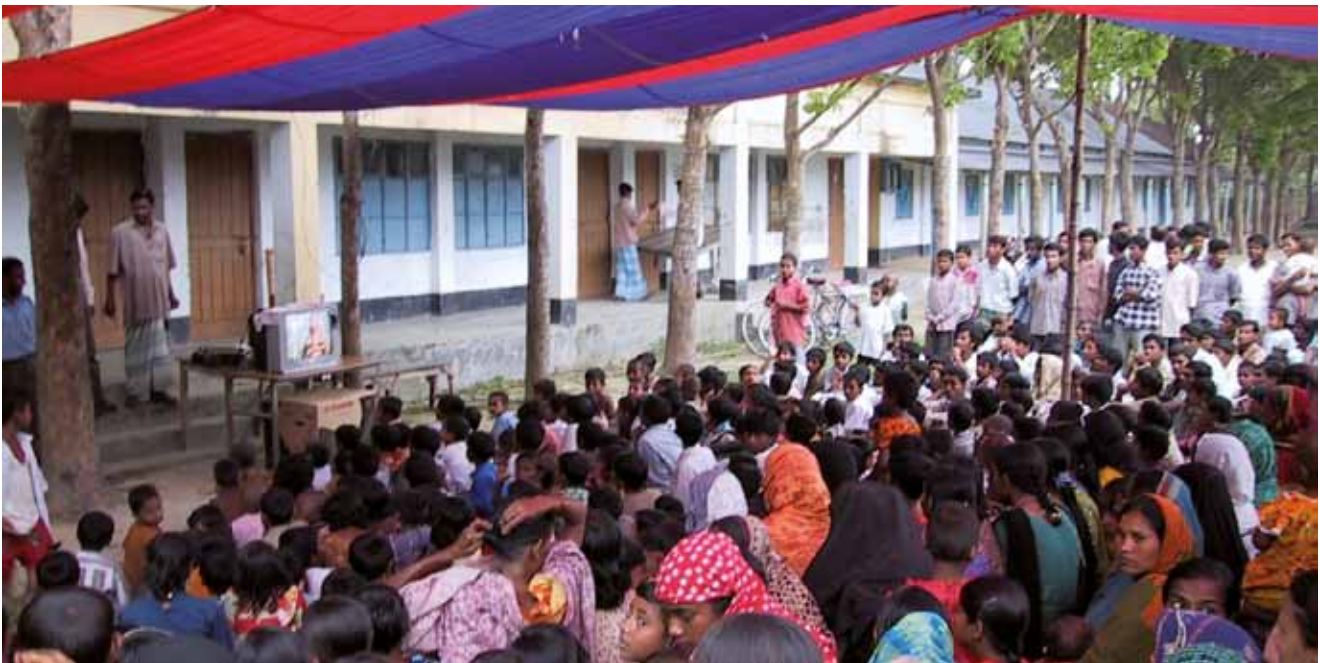
Bangladeshi video experiences laid the foundation for the Access Agriculture approach.

he had the Bangladeshi seed videos translated into various African languages.