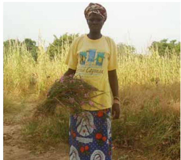
At work uprooting Striga.

One group of women in the north-eastern village of Daga have their own story. Despite efforts to combat Striga, the farmers were not yet managing it.