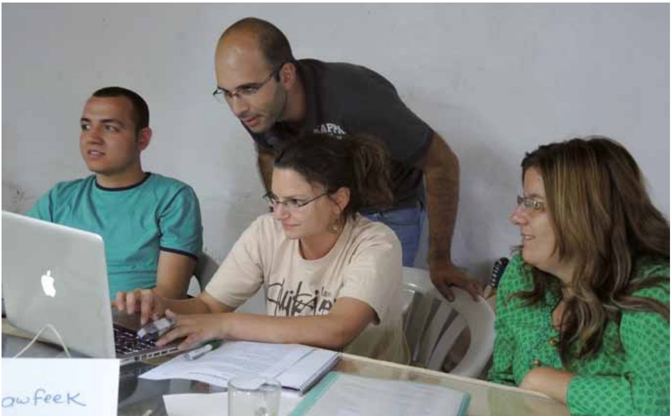
It is easier to develop content for videos when you have good colleagues.

and humorous ways of transmitting messages about sustainable farming started to develop.