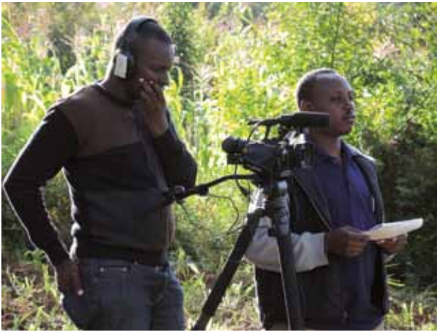
Video gives a personal touch to stories about farmers and their innovations.

When you put some clever words together, and add some nice pictures in a creative layout, you have a magazine. This is a portable medium which can easily explain step by step certain farmer innovations. As the