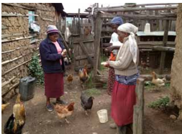
Women especially like videos on small livestock.

The Kenya National Farmers Federation (KENAFF) is a national farmers' organisation covering the whole country. KENAFF is the umbrella organisation of farmers groups, representing the interests of about 2.1 million farm families in Kenya.