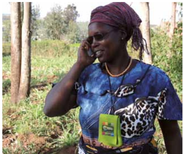
Access to digital communication devices is exploding in rural Africa, but some people are better connected than others.