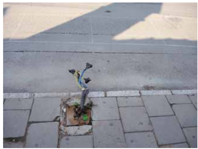
It is now possible to watch videos even without electricity.

By using a laptop, we have increased our projections from five to ten per month and can return to the same village to explain the content and to repeat the projection. In villages which have access to electricity, we sell them the DVD with 10 videos for the bargain price of 1 dollar.