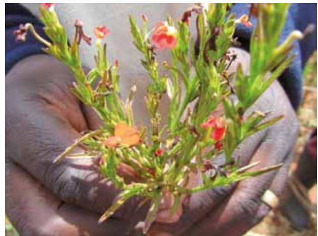
Farmers were keen to show what they had learned from videos about controlling the parasitic weed Striga.

During this third visit some farmers asked me to visit their farms, to see that no Striga had grown and that the crops were growing well, because they practiced the methods they watched on the videos. Nearly 60 farmers asked me, but I only had time to visit five of them. Two women with neighbouring farms were able to work together to remove Striga. One farmer stressed the clarity of the videos and how easy it was to follow their ideas.