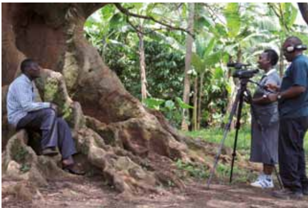
The video maker may hurt people’s feelings if interviewees are deleted from the final version.

“The Local Council Chairman was stammering, frowning and repeating himself so I had to eliminate him and keep the other farmers”.