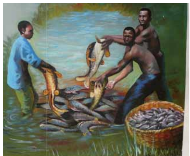
Songhai thinks that farming should be interesting, profitable, and environmentally sound.