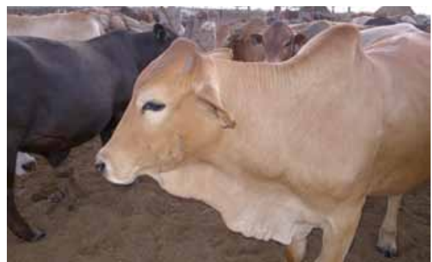
Gifts of equipment and livestock may help to attract lead farmers, but also to alienate them from the neighbours they are supposed to teach.

Most of the farmers told me that they had no particular method because to them Striga was just