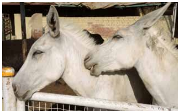
Videos on topics such as donkey health are of great interest to every Egyptian farm family.

The impact was immediate: farmers directly involved in Nawaya activities were interested in using video as a way to express themselves. Egypt is a media-oriented country and every household has a satellite TV. We created a small scriptwriting team, and creative