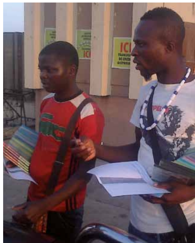
Mobile vendors offer Access Agriculture videos for sale alongside entertainment DVDs.

I was surprised to realise that some of the people were from far away. They were in Nigeria, Niger, Ghana,