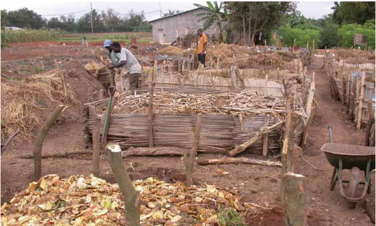
Youth will stay in agriculture if they can make some money from farming. Songhai shows Access Agriculture training videos once a week.

tomorrow need to have good practical and business skills.