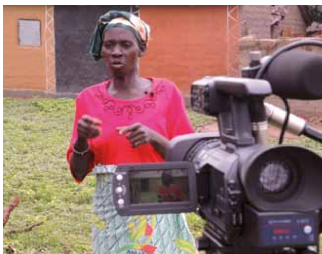
Most farmers are happy to share their experiences without being paid.

These farmers are major cowpea producers and they are known for having problems with thrips. After identifying the village, I went there for a first contact visit and to discuss my purpose with researchers and farmers.