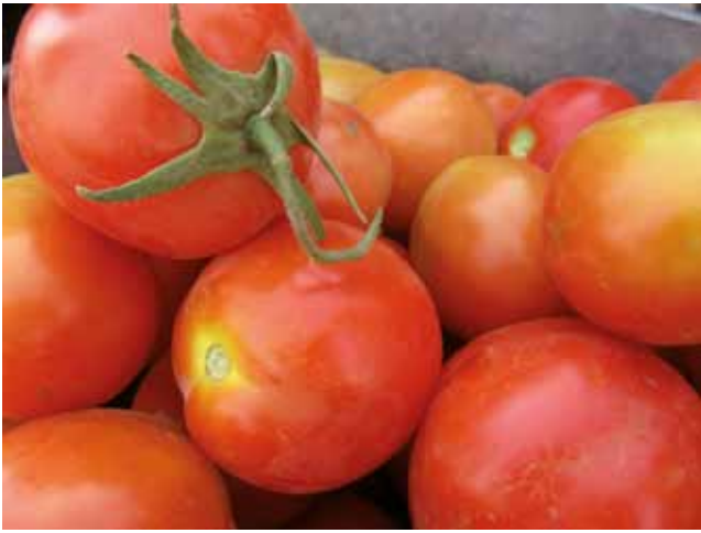
Vegetable growing is a hot topic for young farmers.

therefore would not be able to practise the techniques shown on screen.