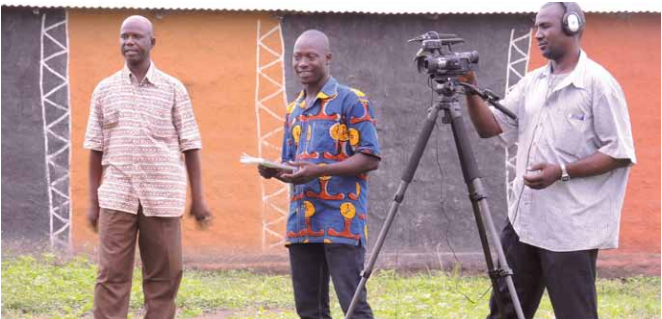
Farmers can have unrealistic expectations about appearing in a video.

Puzzled, I tried to repeat the context and purpose of this video, and provided all the explanations I had given at our first encounter. For example, I explained that I am working for a development NGO and that the videos will be used to train other farmers who do not know the technology yet.