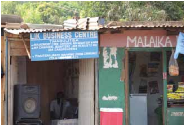
A new business emerges in Malawi, uploading entertainment videos for villagers on their cell phones.

cell phones filled up with films to watch at home, in cities and in rural areas.