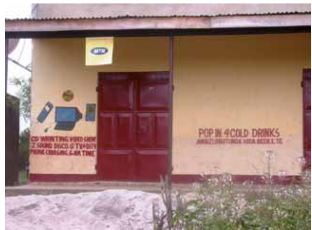
Many rural telecentre initiatives failed because they lacked content for farmers.

We were surprised when one of the female farmers in Kyendangara village told us: “Learning through videos does not occur while in the video hall, but occurs outside when farmers can discuss, reflect and share experiences to practise what is being screened”.