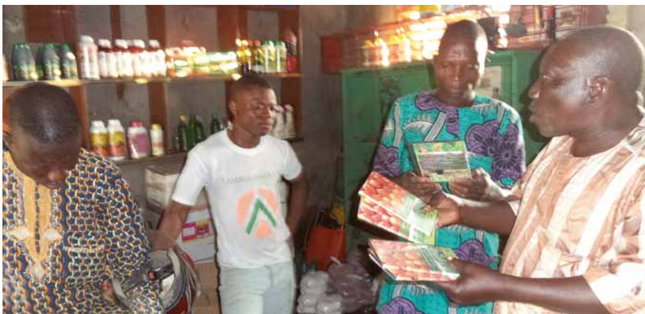
An agrodealer explains the “Improving Vegetable Production” DVD to farmers who visit his shop.

Selling DVDs gives anyone who is interested in agriculture a fair chance to learn from videos, since the DVDs are marketed openly where people can easily find them, and the price is fairly affordable even for a smallholder farmer or an association. On