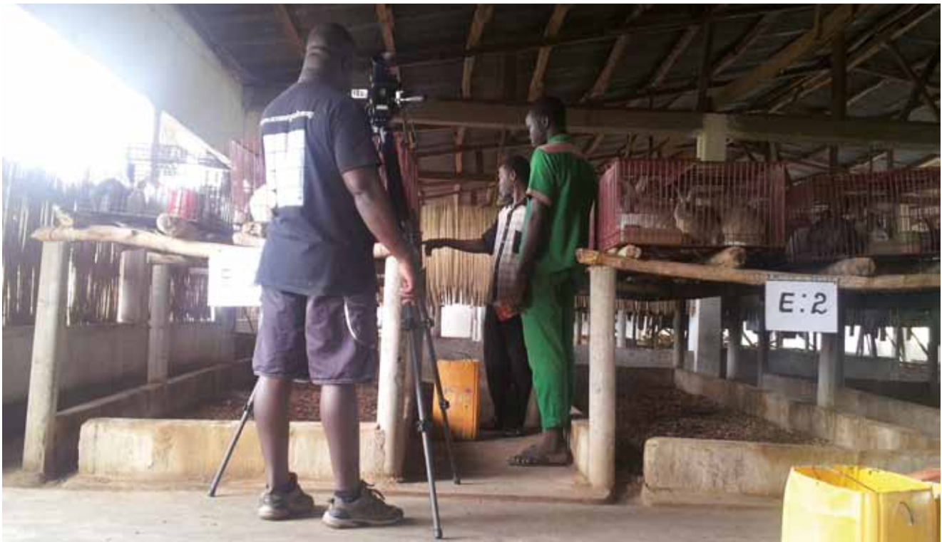
Making videos has taught me a lot about agriculture, enough to start my own enterprise.

When I am developing a video, my questions do not dry up until I understand the topic completely. This is a wonderful school that I am attending!