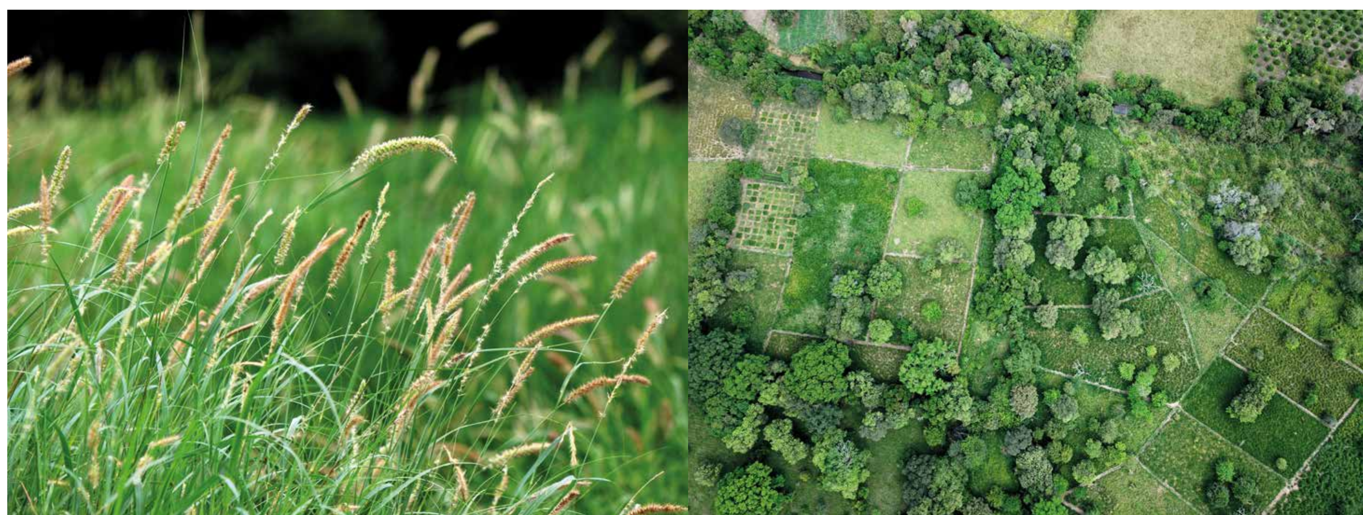
Photo 2: Plot of Cenchrus ciliaris (left). Aerial view of the plot (right).

Once the collection of 20 accessions was established, an agronomic evaluation was carried out using the methodology of the International Network for the Evaluation of Tropical Pastures (RIEPT), which takes into account variables such as vigor, coverage, height, incidence of pests and diseases, flowering, green forage and dry matter production.