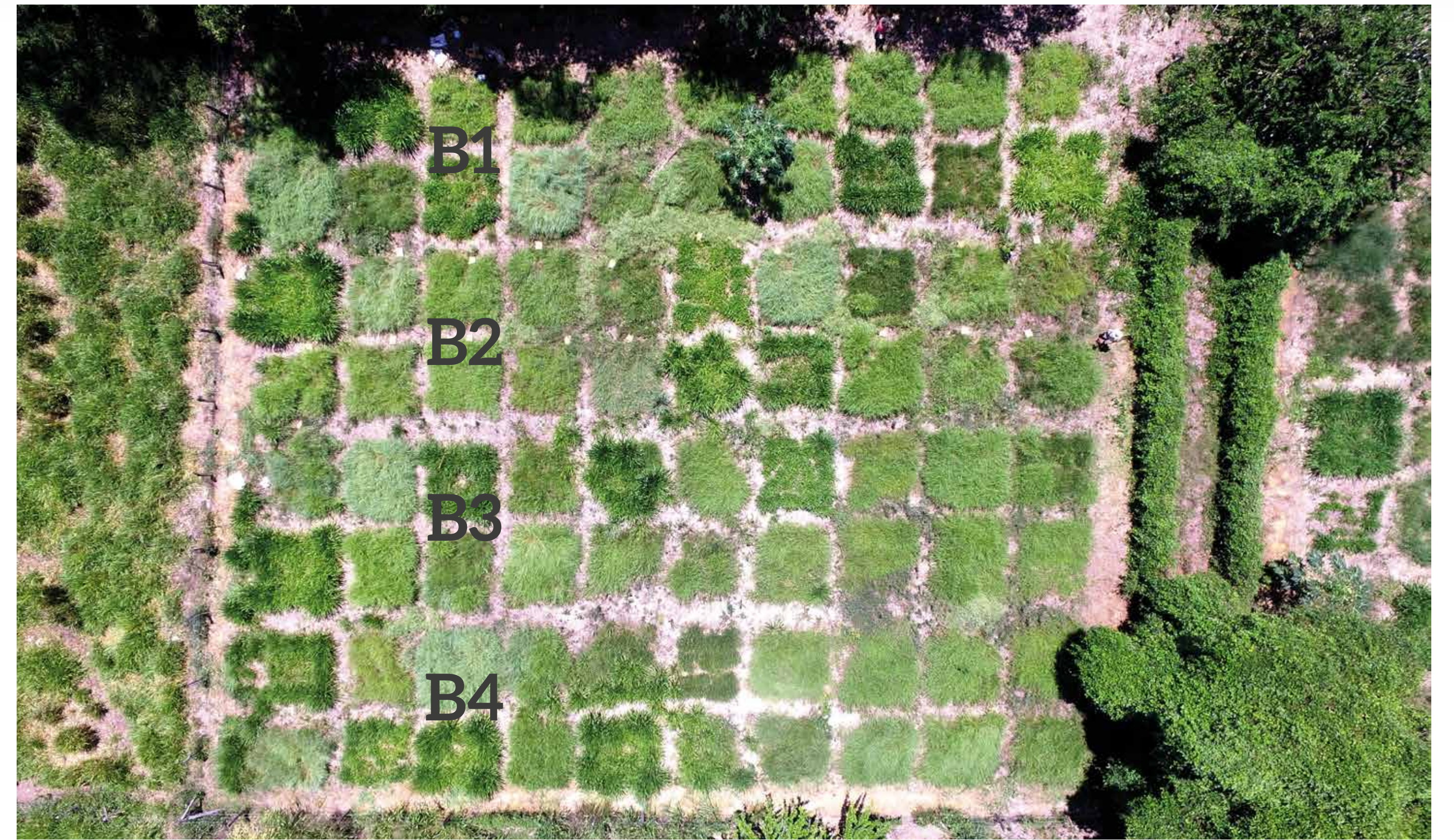
Photo 3: Randomized complete block design, with four replications, and using for control commercial materials previously evaluated in the region (e.g. Brachiaria brizantha cv. Toledo).