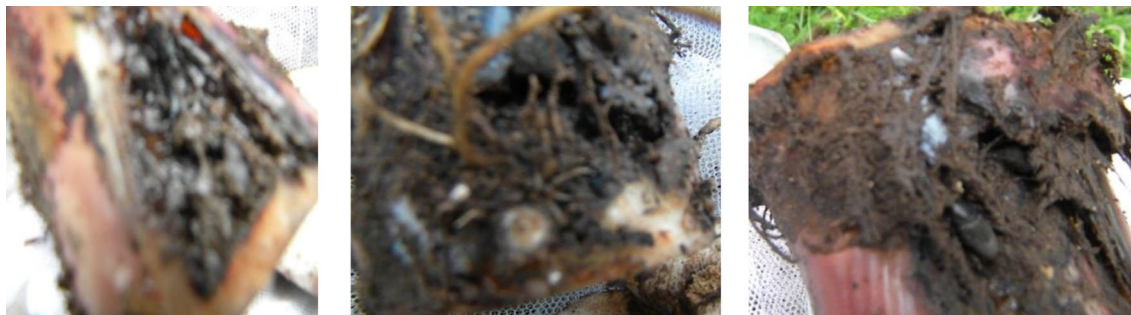
Fig. 4 Representative banana pseudostems showing above the collar damage caused by banana weevil collected from different sites

The results showed that there are low peripheral damage (PD), low total cross section damage (XT) and no ACD caused by weevils from western Uganda and this explains why the yield loss caused by banana weevils in western (Mid-west and Southwest regions) Uganda is negligible. The report [20] is in agreement with these findings. Western region had the highest yield of banana in Uganda at 6.0 metric tons/hectare, whereas banana weevils collected from central (Wakiso and Mukono) and southern Uganda (Masaka and Rakai) caused significantly very high ACD as compared to the weevils from western Uganda (Mid-west and Southwest regions).