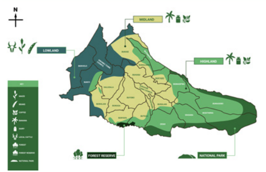
Eigure 2. District of Sironko map based on agro-ecological zones.