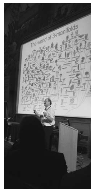
McMullen and his vision on the wilderness of 3-geometry

the Poincaré conjecture in dimension 5 and higher, talked about topological problems post-Perelman. The last talk of 8 June was delivered by Simon Donaldson who spoke about invariants of manifolds and the classification problems with a special emphasis on manifolds with additional structures like symplectic manifolds in dimension 4. After the talks a reception took place at ENS-Ulm.