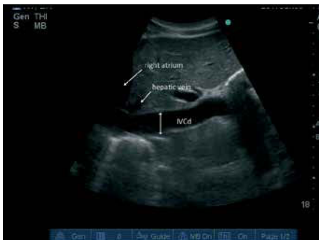
Figure 2: Inferior vena cava diameter longitudinal view (IVCd)

After the recorded CL was found to depict the IVC adequately and with good quality, the loop was then scrolled to the biggest diameter (IVCd max ) and measured, followed by the same measurement in the smallest diameter (IVCd min ). These two values can be used in a specified equation, resulting in a classification of the volume status.