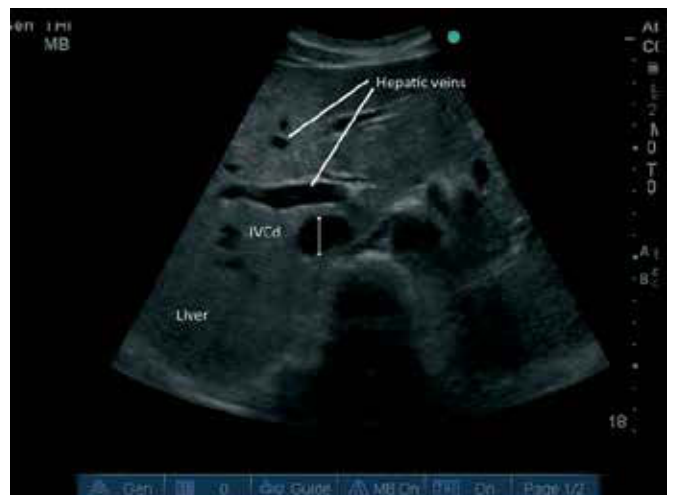
Figure 3: Inferior vena cava diameter transverse view (IVCd)

The recorded CL allowed for assessment of intravascular volume status. With sufficient quality and adequacy of the CL, the recording was subsequently assessed for intravascular volume status. Several studies have confirmed that for IVC-US non-experts, nurses as well as others in the medical profession were able to adequately perform the scan and the subsequent classification for volume status after receiving appropriate training (Dalen et al. , 2015; Gómez Betancourt et al. , 2016; Muniz Pazeli et al. , 2014; Steinwandel et al. , 2017a). Yepes-Hurtado et al. (2016) have expressed concerns about the use of IVC-US as the single parameter for fluid status estimation, but we believe combining IVC-US-based volume classification with other traditional objective parameters has good potential to reveal a clearer picture of an individual’s volume status.