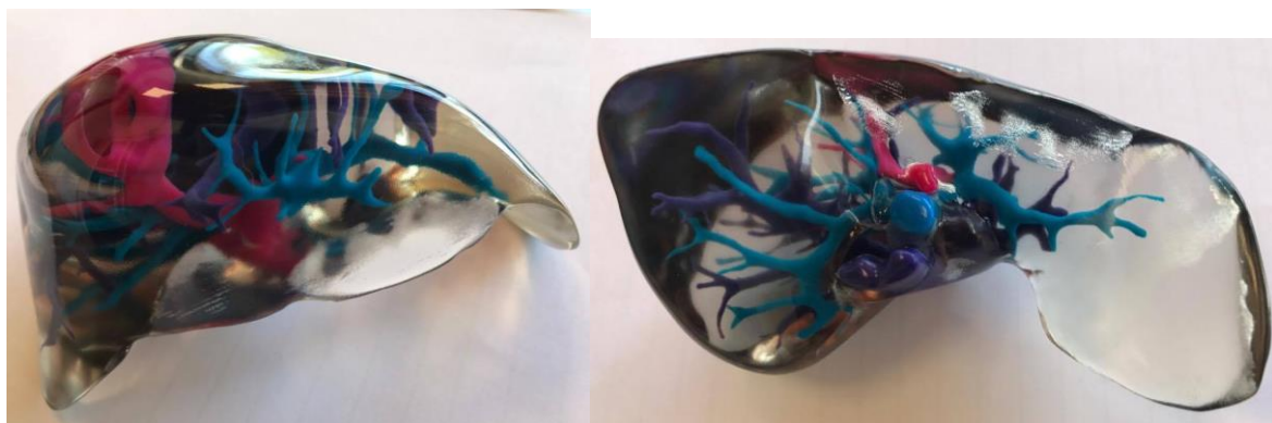
Figure 2. 3D printed model of hepatocellular carcinoma. A: Anterior view of the 3D printed liver model. B: Inferior view of the 3D printed model. Pink colour: tumour and hepatic artery, purple colour: hepatic vein, blue colour: portal vein. The model was printed with a scale of 60% of original size with use of Vero Clear/Transparent photopolymer. Reprinted with permission under the open access from Perica E and Sun Z [39].