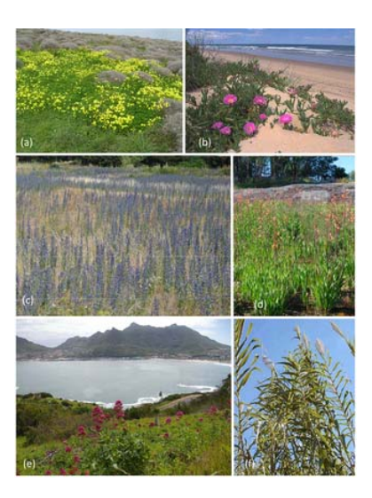
Figure 1. Examples of naturalized alien herbs and geophytes in the five mediterranean-climate regions.

1a) The South African geophytic species Oxalis pes-caprae in Lesbos island, Greece, Mediterranean basin; 1b) The South African succulent species Carpobrotus edulis in California, USA; 1c) The Eurasian biennial herbs Echium plantagineum and E. vulgare in Región del Maule, Central Chile; 1d) The South African geophyte, Watsonia meriana var. bulbillifera on a granite outcrop in south-western Australia; 1e) The Mediterranean basin region herb, Centranthus ruber in the Cape Region, South Africa; and 1f) The tall Eurasian grass, Arundo donax in a Californian riparian system. Each of these species have become naturalised in multiple Mediterranean-climate regions.