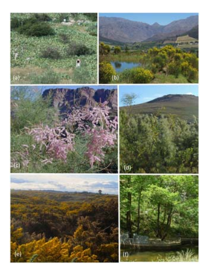
Figure 2. Examples of naturalised alien shrub and tree species in the five mediterranean-climate regions.

2a) The southern USA succulent shrub Opuntia ficus-barbarica in abandoned grazed lands, Stylida, Greece, Mediterranean Basin; 2b) The Mediterranean basin region shrub, Spartium junceum in the Cape Region, South Africa; 2c) The central Eurasian tree Tamarix ramossissima, in coastal California; 2d) Two Australian shrub species, Hakea gibbosa and Acacia longifolia in the Cape Region, South Africa; 2e) The European spiny fabaceous shrub, Ulex europaeus in Chillán, Región del BioBio; and 2f) The east Asian tree Ailanthus altissima in central Greece, Mediterranean Basin. Each of these species have become naturalised in multiple Mediterranean-climate regions. doi:10.1371/journal.pone.0079174.g002