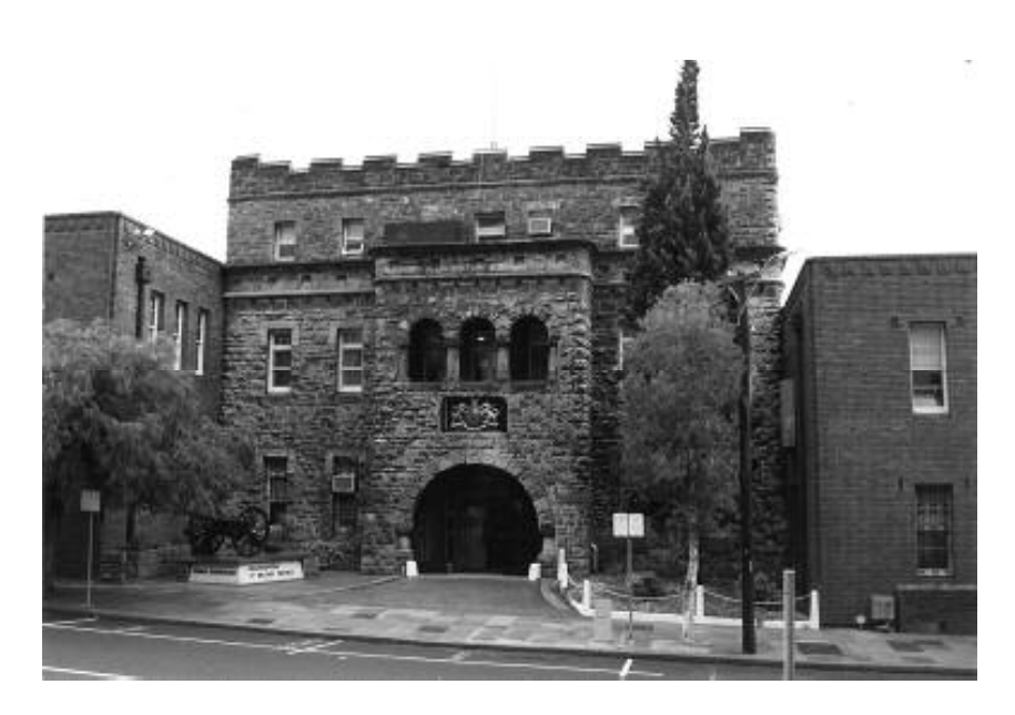
Fig 3 – Perth Drill Hall administration building Francis Street 1992 while still occupied by the Army.