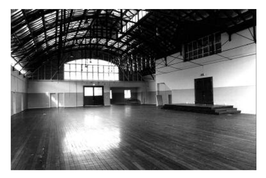
Fig 5 – Perth Drill Hall 2002 interior of drill hall space.

In terms of supporting the practices of discipline and drill the Perth Drill Hall was a model space – not all drill halls or spaces used for drill could claim this, particularly those adapted from other hall spaces. But it was a space that could also claim to embody moral concepts – firstly, through the linkage between drill practices and militant Christianity, and secondly because some of the Perth Drill Hall rooms were originally given over to recreational pursuits and the pastoral care of volunteers. It can of course, be argued that these spaces were also provided to attract volunteers as much as provide for their well being. To claim that the spaces of the Perth Drill Hall actually did produce good citizens and Christian soldier heroes would be going too far. However, it can be claimed that these moral concepts are embedded in the practices used to design and construct the place and that the building can be interpreted in this way.