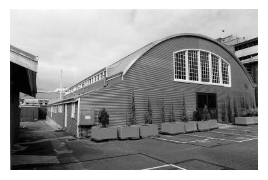
Fig 4 – Perth Drill Hall 2002 from east.