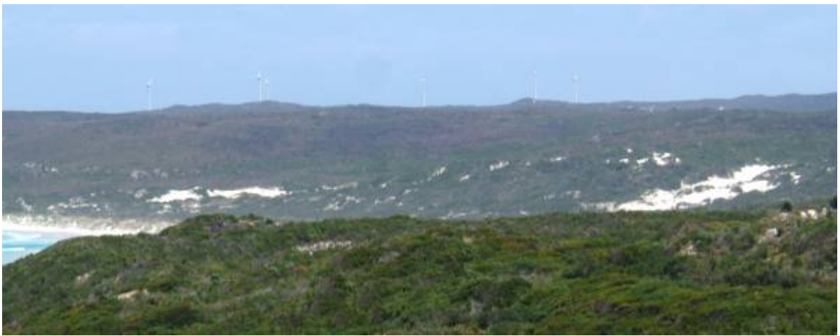
Ten Mile Lagoon Wind Farm