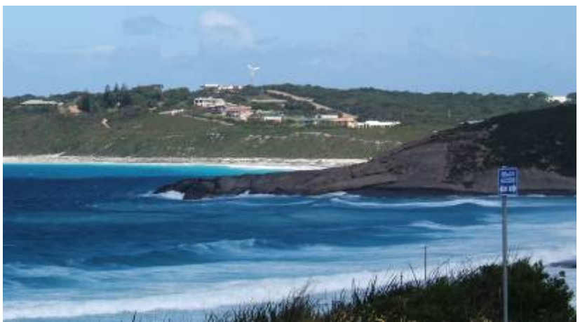
Salmon Beach Wind Farm