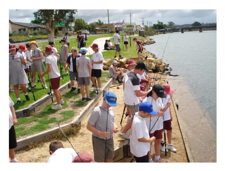
Figure 3: Hey Kids Let's Go Fishing.

Results of a school summary survey conducted on the Hey Kids Let's Go Fishing Program were generously provided by Doug Joyner, Australian Fishing Trade Association (AFTA). The survey yielded 118 responses from 40 high schools, 72 primary schools, one K-12 school and 5 other organisations. All responses agreed that the program was rewarding and enjoyable and 100% of those that completed the program agreed it made children aware of responsible fishing practices. The feedback received was overwhelmingly positive (see Figures 2 and 3).