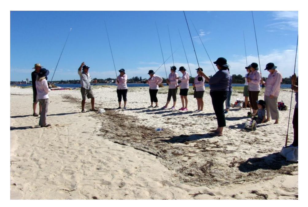
Figure 8: Pink Fly Fishers on the Swan River.

RecfishWest noted during the running of the program, participants had the opportunity to interact socially before, during and after fishing.