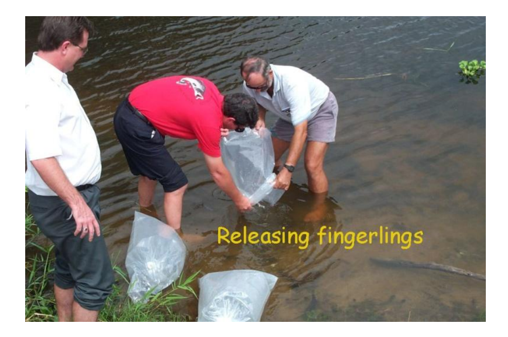
Figure 6: Townsville Restocking Society.

Fishcare Victoria runs regular events that educate people on sustainability, compliance with regulations and also support selected community groups such as the disabled and seniors. A one-day fishing trip exclusively for women is currently being planned. Most recreational fishing clinics and events rely heavily of the support of volunteers and as such play an important role in building community awareness.