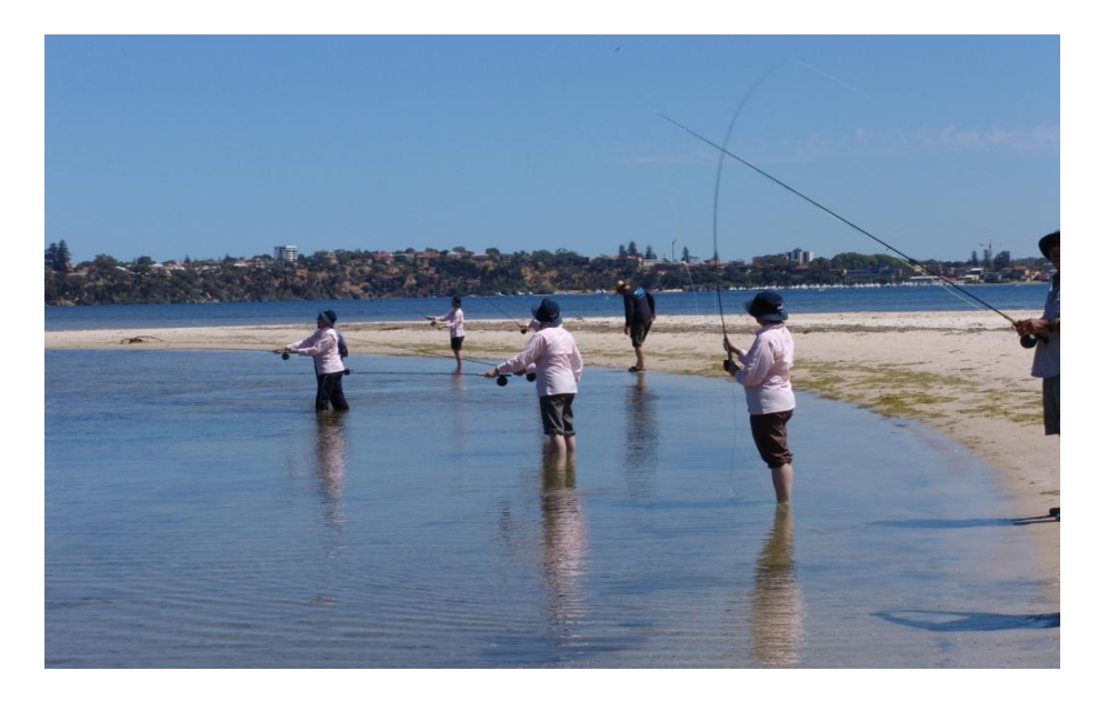
Figure 7: Pink Fly Fishers on the Swan River.