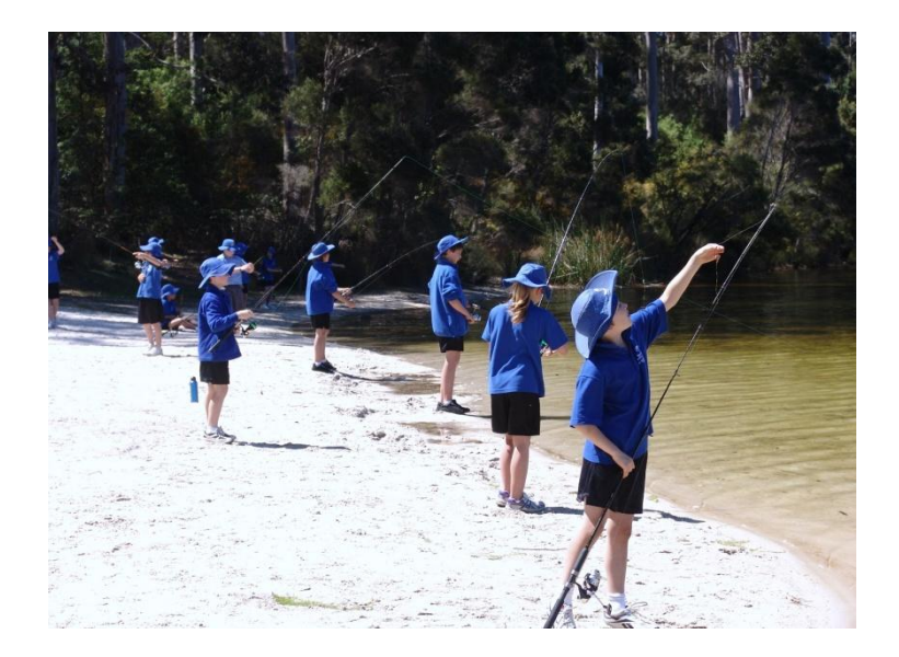
Figure 2: Hey Kids Let's Go Fishing.