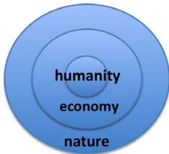
Figure 2. A buffer model of the global system; Giannetti, 1993

Based on the co-evolutionary paradigm (e.g. Norgaard, 1997), it is possible to model the interactions within the global “humanity–global economy–nature” system. The important point is that all three should be modelled and analysed simultaneously in terms of their global interactions. In other words, a model: (1) should not be representing only one of the components (e.g. the economy) against the other two; and (2) should allow a study of the conflict and risk factors together with the resulting changes of transformation and co-adaptation that shape the co-evolutionary process. Hence, sustainable development is not only a macroeconomic concept, it is not only nature conservation either. It can be social advancement but again cannot happen in isolation from nature and the economy. Sustainable development is a development that synchronises and harmonises economic, social and ecological processes.