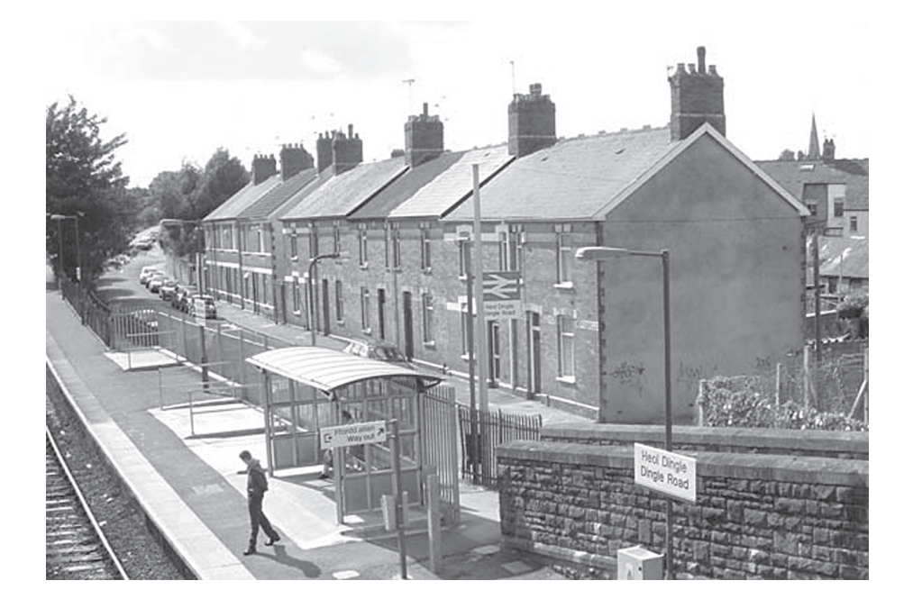
Figure 3. Transparent Shelter

That transparent shelter is tidy—you can see all around. (F6)