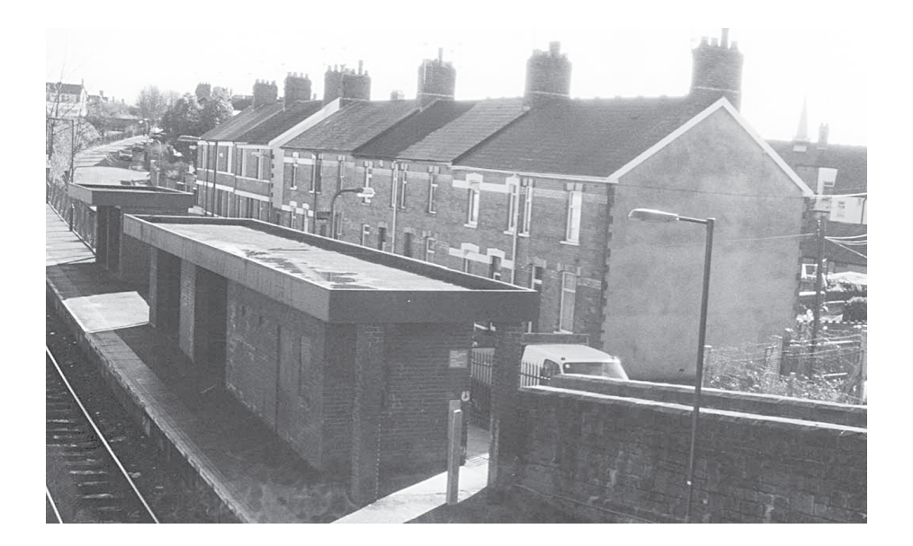
Figure 2. A Typical Brick Shelter Found on a Valley Lines Railway Station

It smells like a toilet— and even looks like one! (F20)