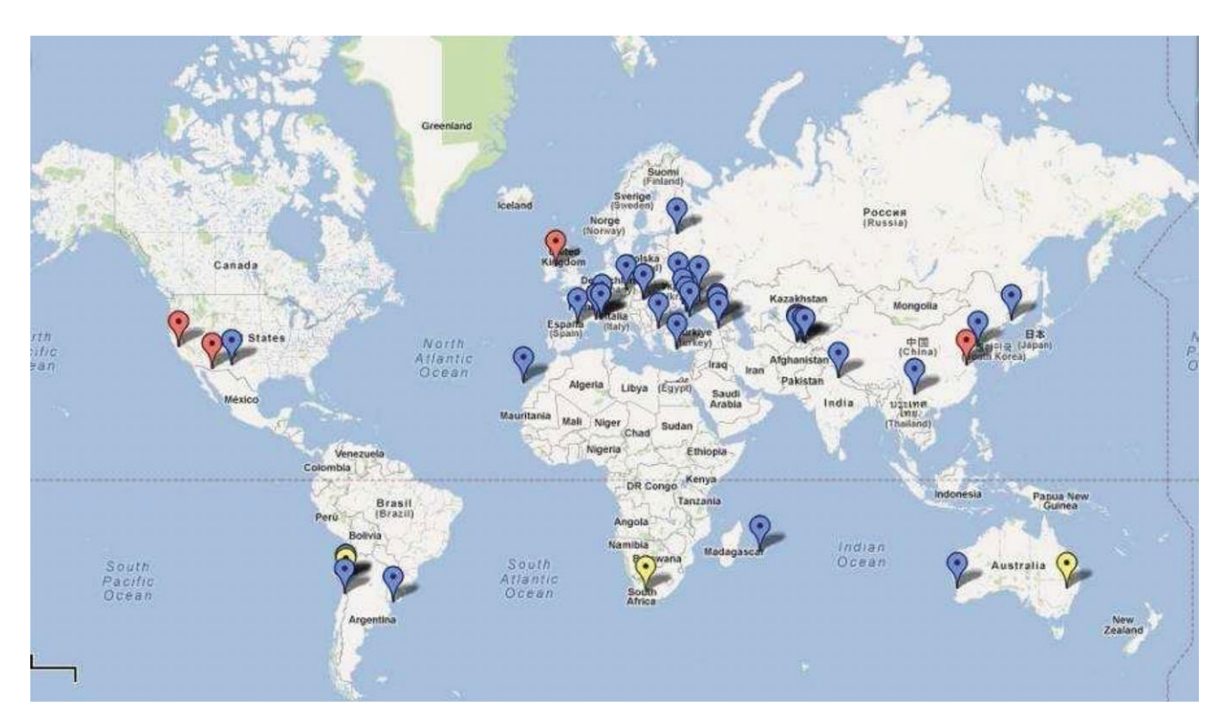
Figure 1. The global distribution of observing stations participating in the Gaia FUN-SSO. The distribution is biased towards northern latitudes and European longitudes. Blue markers are the current observing stations, red markers are existing facilities which have expressed interest but are not confirmed, and yellow markers are planned future facilities.

at rather low solar elongation (45°), enabling detections of Earth-crossing asteroids (Atens) and inner-Earth asteroids (IEAs), and discoveries of new NEAs at larger solar elongation. In performing an all-sky survey, Gaia will necessarily survey regions of the sky away from the regions targeted by NEA programs. This holds the potential to discover asteroids with high orbital inclinations and Trojan asteroids in the stable Lagrangian regions in the orbits of the planets in the inner Solar System (Todd et al. 2011, 2012a, 2012b).