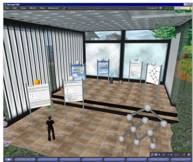
Figure 2. A learning landscape with six learning objects and a skill structure model at the beginning. The orange marker of one learning object indicates that the learner should do this object first.

skill structure object with nine skills. In this example, learning objects are realised as simple text panels, however they also could be more complex models. Each learning object has a marker at the bottom which shows the current state of the learning object. There are three possible states, green means that the learning objects has been done by the learner, orange means that this object should be done next, and grey means that this object should be done later. The skill structure model shows the skills for this example domain in a prerequisite structure. Skill can have two states, green spheres are already acquired skills and grey spheres are not acquired skills. The learner who walks through the learning landscape is represented as the avatar in the front (Figure 2) and in the back (Figure 3).