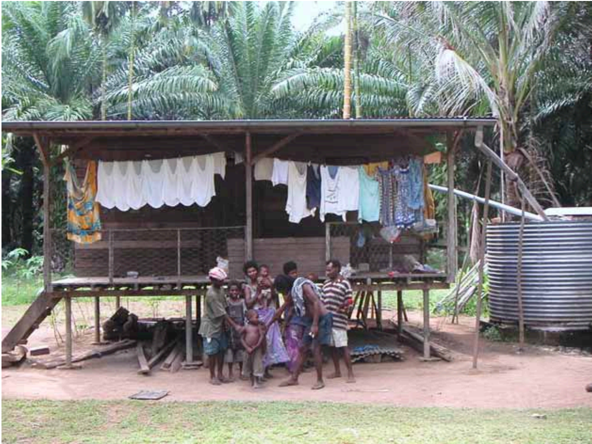
Plate 1 Typical settler's house on the land settlement scheme

When the oil palm LSSs were established in WNB and Oro, people from land-short areas of the country were given priority for resettlement on the leasehold blocks. Settlers acquired individual 99-year State agricultural leases over landholdings ranging from 6 to 6.5 ha (Hulme 1984) (Plate 1). Pre-existing smallholder cocoa blocks on State LSSs in the oil palm project areas in both provinces were replanted to oil palm and incorporated into the new LSS subdivisions. Over time, the population on the leasehold blocks grew steadily, leading many second-generation settlers to seek additional land for oil palm (Koczberski and Curry 2005).