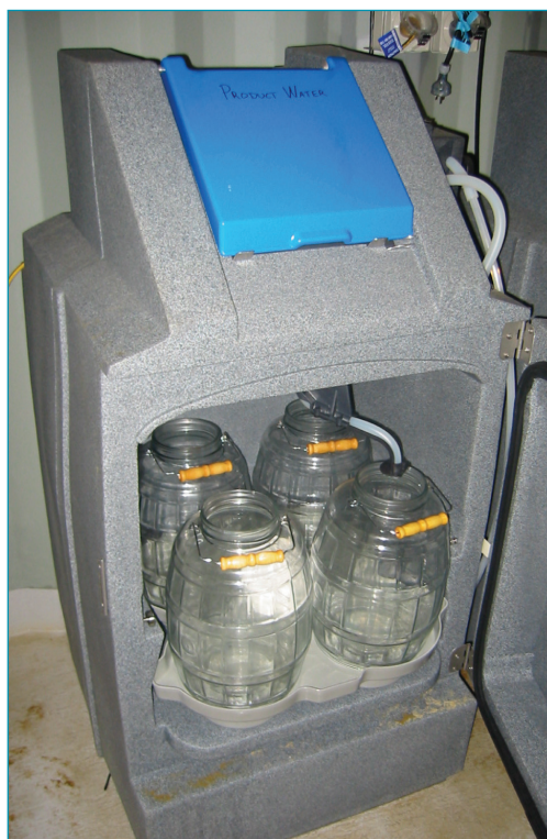
Figure 2. Composite samples were taken using an automated ISCO 4700 refrigerated sampler over 24h.

Samples were collected from Perth's three main WWTPs: Woodman Point, Subiaco and Beenyup. These plants treat 85% of the wastewater produced in the Perth metropolitan area and receive water from varied sources. The Beenyup WWTP serves the north of the city, which is mainly residential. The plant has a current capacity of 120 megalitres per day (ML/day) that serves a population of about 600,000 and a planned upgrade to treat 200 ML/day. The Subiaco WWTP services the Perth central area and has a