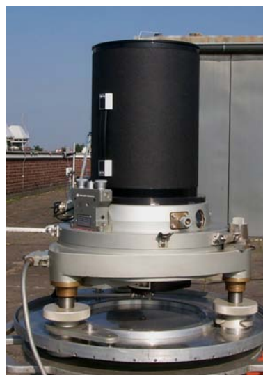
Figure 1. The transportable digital zenith camera TZK2-D

Most of the mechanical and optical parts of the two systems are identical, however there are some differences: The levelling of the zenith camera TZK2-D used at IfE is operated by means of three manually handled levelling screws and two electronic tiltmeter. The change of orientation to the opposite position is done manually, whereas all activities concerning the steering of the CCD camera including the time keeping (determination of the epochs of the exposures) by means of suitable GPS equipment are automatically monitored by the computer. The motorization of the system similarly to the one realized by GGL is planned.