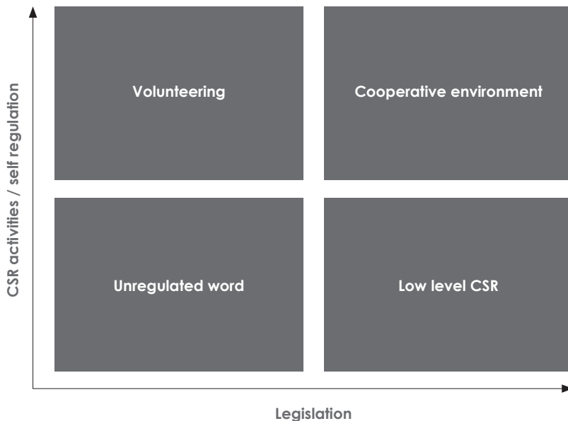
Figure 1. Regulatory Environment for Industry's CSR Activities

The levels of CSR activities / self-regulation and legislation therefore define four different scenarios.