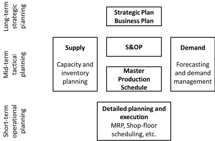
Figure 1 The Sales and Operations Planning process in the context of various types of business planning. Adapted from Figure 2-1 in Wallace & Stahl (2008).