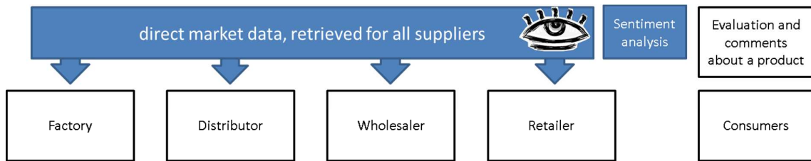
Figure 2. A simple supply chain showing a delay in information transmission along the supply chain and different types of information.