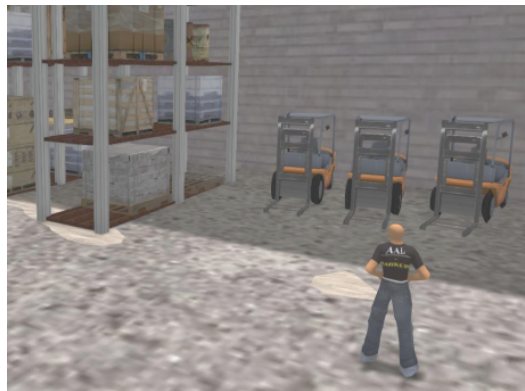
Figure 2: A user in the warehouse scenario