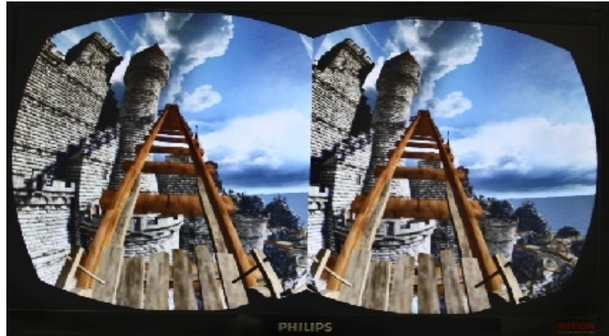
Figure 4: Roller coaster using the Oculus Rift

The roller coaster scenario elicited the most intense emotions and feedback (Figure 4). One participant stopped this scenario part-way through as they felt uncomfortable; thus, the number of participants was reduced to 12. The participants were asked to remain standing as we wanted to amplify the anticipated movements that might occur as a response from the visualisation of the track. However, one participant was excluded at the start when we paused the ride for them to sit down: "I cannot stand [upright], that would make me pass out." We stayed nearby to catch the participant in case they became physically over-balanced. The roller coaster started immediately; yet we did not place the headphone on the participant heads in the beginning, but waited at least 10 seconds for a comment like "realism would be better with sound." In all cases, we placed the headset on the ears of the participants after a while and pretended that we forgot about it. The roller coaster itself takes place in a fantasy castle, has high altitudes, and a jump at the end. With all but one participant we could infer where on the track they were at any time simply by observing their matched physical movements. One participant felt so present that it almost caused them to lose their balance (at an unexpected curve just as the ride appeared to be over). Further observations include (note that the frequency may be low as some participants did not report accurately):