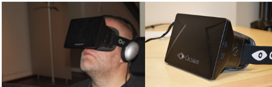
Figure 1: The Oculus Rift HMD in use and the headset at rest.

A similar setup is a HMD using LCD screens to cover the complete range of viewpoints. Low-latency sensors detect even small head movements so the visual display can be updated accordingly. Kinect uses a depth scanner to analyse the space in front of the device to identify movements, while the Razor Hydra tracks the movements by being held in the hands.