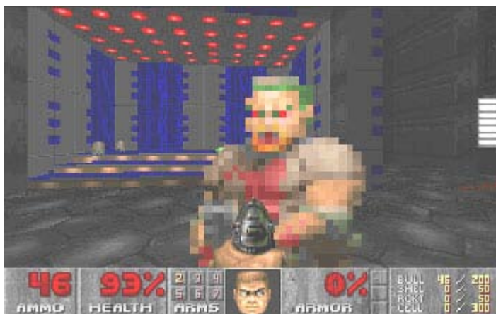
Figure 2: The original Doom (1993). 2D low res bitmapped characters on low res 3D backgrounds.

Thus, we can see that in 1993 personal computers were hundreds of times less capable of creating the images and sounds of a virtual world. Having both high image/sound resolution and real time responsiveness was impossible. Designers were left with the difficult decision of what aspect of their possible environments they would like to implement, and which to sacrifice. Myst and Doom , with different immersive/gameplay ambitions, went in two opposite directions. Myst went the visual "high and slow" road, and Doom went the "low and fast" road.