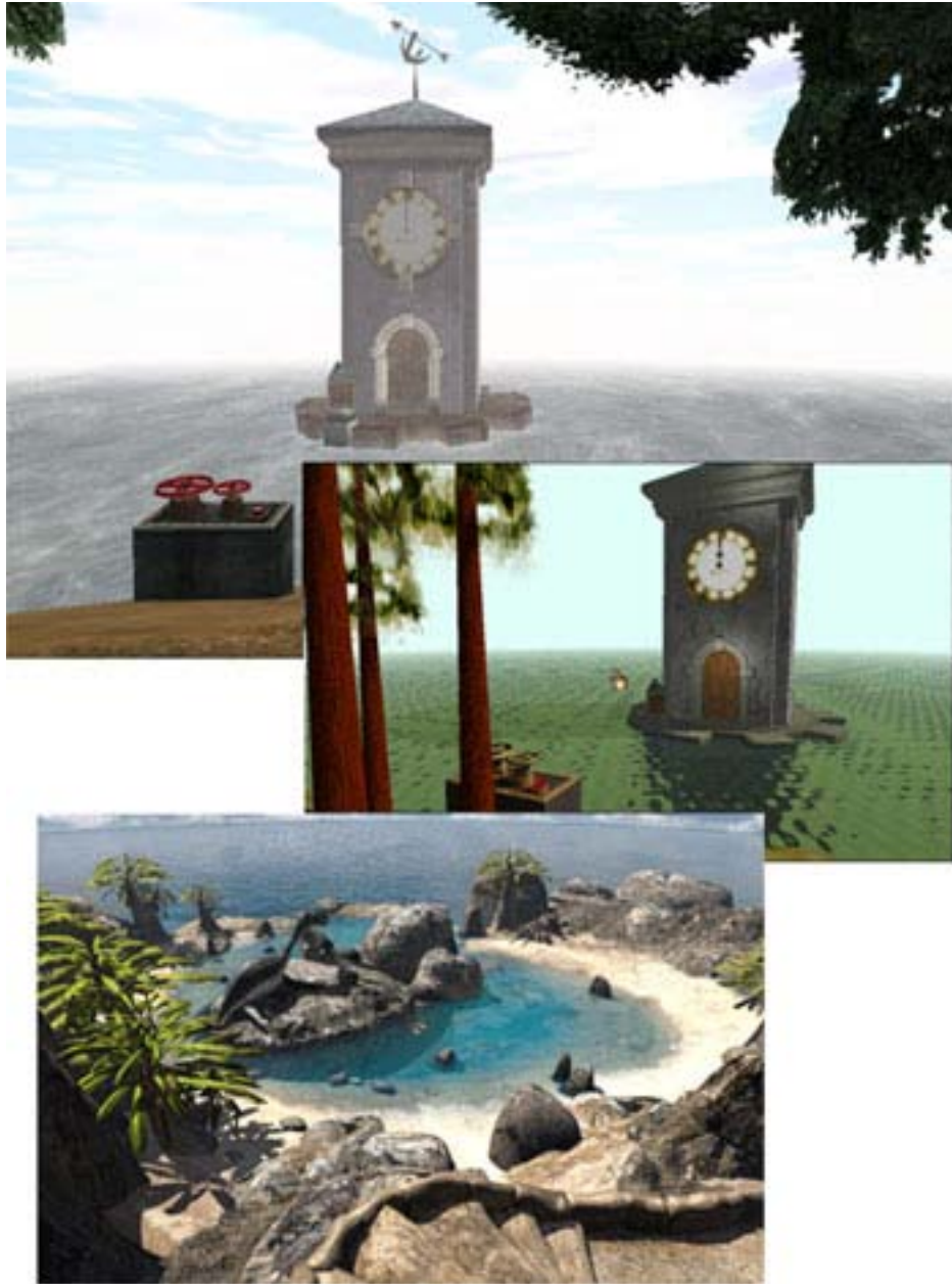
Figure 5. Water treatments in the Myst titles. All screens are shown in correct relative size. Top: realMyst (2000), with full motion of the oceans, and dynamic weather effects. Middle: The ocean in Myst (1993). The black blobs on the surface of the water are not an oil spill, just the result of the reduction of detail in the 8 bit colour graphics (posterisation). Bottom: The “whark cove” in the more photo-realistic Riven (1997), which also had full screen transitions.