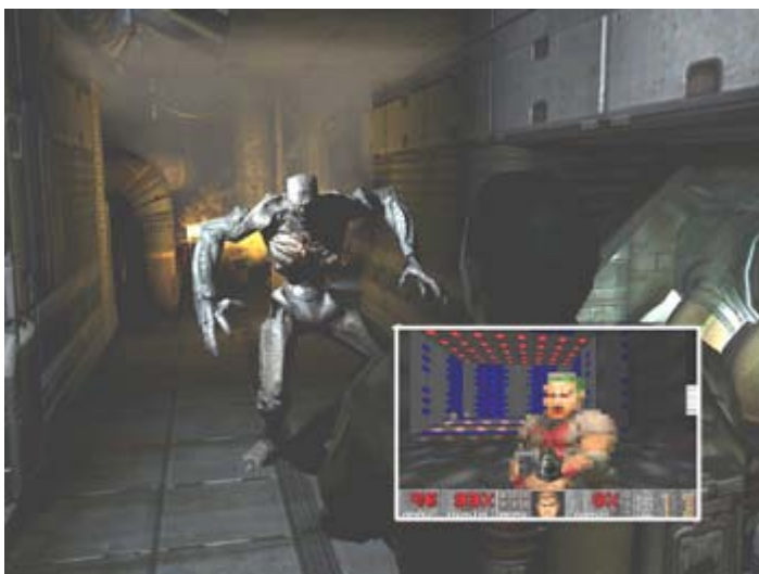
Figure 4: The original Doom (1993) superimposed on Doom 3 (2004). Notice the difference in size and detail. Additionally, the frame rate is many times higher in Doom 3 .

Another side effect of creating all of the hundreds of images before the game is delivered to the player’s computer is that a large amount of data is produced, and this is why Myst was dependant upon CD-ROM technology to physically deliver it to the player’s computer - and stream it from CD-ROM during gameplay , since there were no hard drives big enough to store it. Unfortunately, early CD-ROM drives were very slow at delivering files, and this produced quite a slow response and/or “jumping” when the player moved from one node to the next, or an “on-top” animation played. In contrast, Doom ’s mathematical descriptions and low resolution textures were originally small enough to be delivered to the computer on a series of floppy discs, transferred to hard drive, and the experience calculated from those small files.