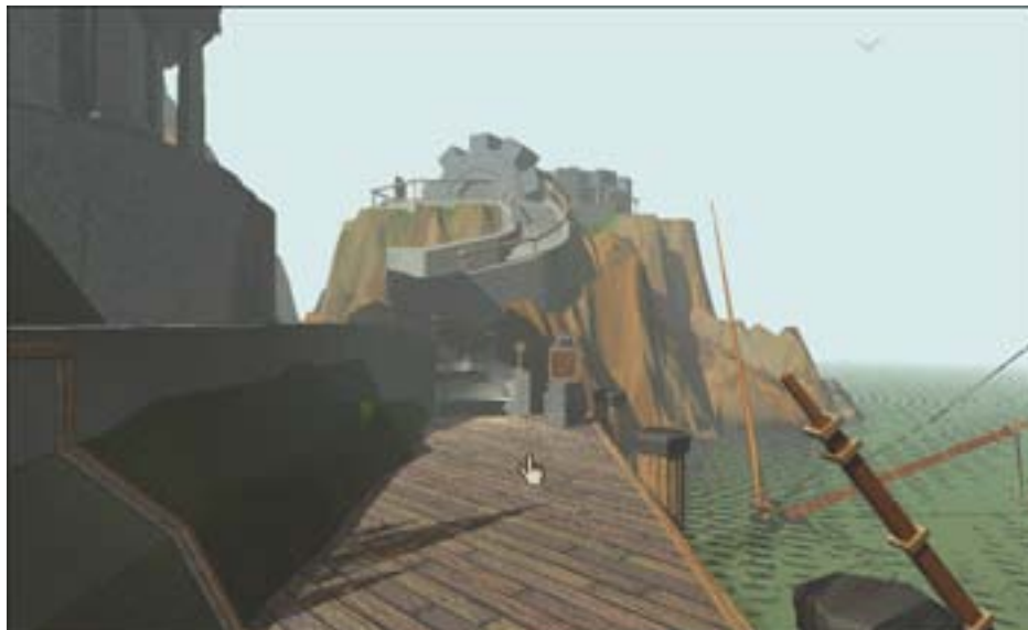
Figure 1. “On the dock” in Myst (1993). The starting view from the first node of the game. The spots in the grass and marble in the left hand side of the image are “dithering”.

Myst anticipated the consumer CD-ROM revolution and became a multimedia sensation, selling over seven million copies. The original Myst has had four sequels, Riven (Cyan, 1997), Exile (Presto Studios, 2001), Revelation (Team Revelation/UBI Soft, 2004), and End of Ages (Cyan Worlds, 2005). Additional game titles derived from the original Myst are realMyst (Cyan Worlds, 2000), Uru: Ages Beyond Myst (Cyan Worlds, 2003) and Myst Online: Uru Live (Cyan Worlds, 2007).