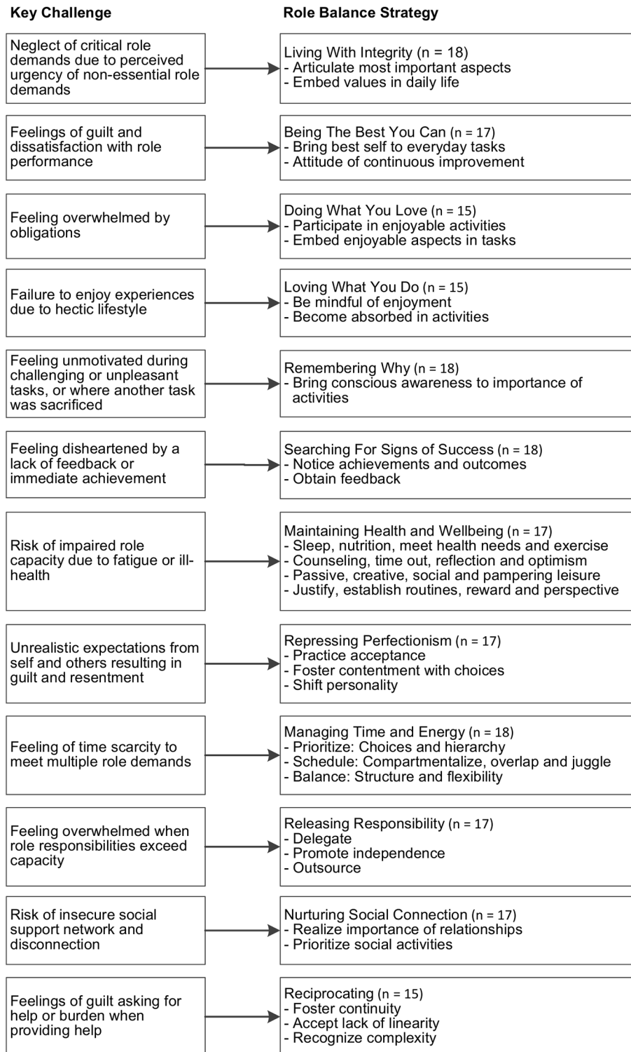
Fig 2. Key challenges faced by working 'sandwich' generation women and associated role balance strategies