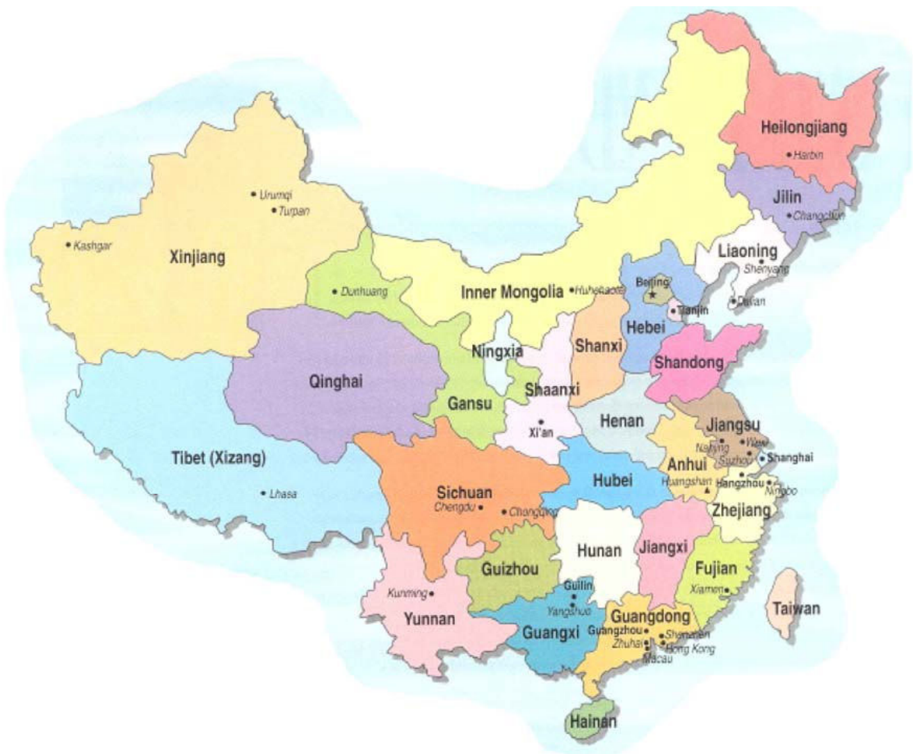
Figure 1 The provinces and the major cities of PR China.

1992) to 83% (in 1993 – 1994); and the 'full breastfeeding' rate increased from 28% before the initiation to 40% afterwards (the cross sectional study, n = 439 ) [7]. Another survey in Beijing (retrospective study, n = 817 ) showed the breastfeeding rate at four months was only 16.42% in 1989 – 1991; but it increased to 56.73% in 1995 – 1997 [23]. A survey at the Beijing Railway Hospital (retrospective study, n = 824 ) showed the same trend: the breastfeeding rate at four months was 16.77% in 1991 – 1994 and 58.77% in 1995 – 1998 [24].