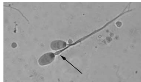
Figure 1 Rabbit spermatozoa with proximal retention of cytoplasmic drop.

T-2 toxin decreased the basic testosterone level by 45% compared to control ( P < 0.01 ) and resulted in lower ( P < 0.05 ) GnRH-induced testosterone concentration (Figure 4). However, there was a ninefold increase in the hormone concentration 75 min after the GnRH injection in the toxin-treated animals