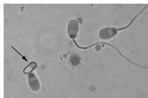
Figure 2 Rabbit spermatozoa with twisted tail.

compared to that of the controls, where a fivefold increase was observed.