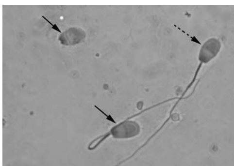
Figure 3 Rabbit spermatozoa with separated head, rolled tail (continuous arrow), and a normal spermatozoa (broken arrow).