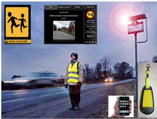
Fig 2 The SAFEWAY2SCHOOL system. The relevant parts for the present study were the flashing “Intelligent bus stop”, the radio transmitter that the children carry as their “bus ticket”, the special yellow signage on the school buses (similar in the video but not identical), the mobile phone which can receive live SMS updates, and the “On-board computer” carrying all the relevant information about every child boarding and alighting the bus

The remaining questionnaire, background information and eye tracking data were analysed using Mann–Whitney U-tests for group comparisons and \chi^2 -tests/Fisher’s exact tests to analyse categorical data. In all analyses, the \alpha -level was set to .05, with the level adjusted by Bonferroni correction where applicable. To estimate the clinical relevance of the findings, Cohen’s effect size (Cohen’s d ) [18] was used for parametric outcomes (large effect \geq 0.8 ) and r [19] for non-parametric outcomes (large effect \geq 0.5 ). Based on the 14 participants in the smaller group (CWD), a power of 80 % ( \beta=0.2 ) was provided by the sample size to detect a standardised difference (Cohen’s d ) between the CWD and the Con groups of 1.3 given the \alpha -value of .05.