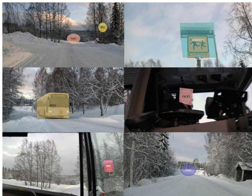
Fig. 1 The five video scenarios (scenario 2, Wait at the bus stop, is represented by the upper right hand slide and the middle left hand slide ) and their relevant areas of interest (AOIs)

Data were analysed using SPSS 20 (SPSS Inc.). The Kolmogorov–Smirnov test was used to test the data for normal distribution, which was only found for the responses to the 50 statements in relation to the five scenarios and regarding the participants' age. These data were analysed with independent samples t-tests.