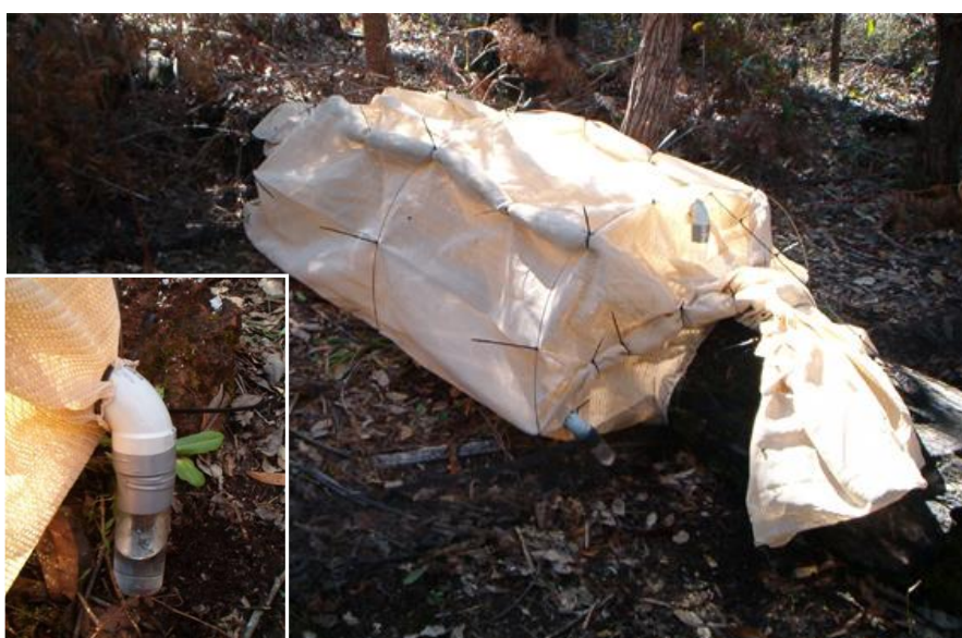
Figure 2. View of an emergence tent around a log, and detail of the collection vial system. This is a 15-year-old rehabilitated mine area.

Sampling was carried out to assess those arthropods living in, or on, the logs. A further suite of arthropods may be associated with the soil or leaf litter beneath the logs, but sampling was not designed to assess this component of the fauna. Emergence tents were employed, using a methodology adapted from Grove and Bashford (2003). Tents were constructed in a cylindrical shape 2 m long using pale coloured woven shade-cloth with 80 % shade rating supported by flexible wire hoops (Fig. 2). The mesh had a triangular gap size of 0.8 mm base by 2.0 mm height. The mesh was sealed along the two ground edges of the log and at either end of the sampling cylinder by stapling the cloth into the wood of the log. Six collection vials were attached to each emergence tent. The vials were filled with 40 – 60 ml of monoethyl-glycol. Although designed to sample log-associated fauna, the tents did collect some smaller arthropods, particularly mites and springtails, which may have moved up from the soil or litter and penetrated the mesh of the tent.