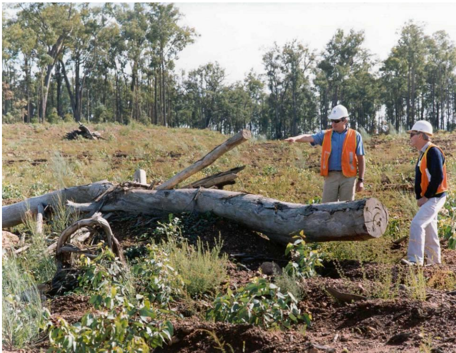
Figure 1. Example of a CWD fauna “habitat” in a rehabilitated mined area. This rehabilitated area is 1 year old. In the background is a second CWD “habitat” and unmined jarrah forest.