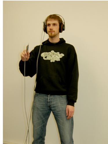
Figure 2: Playing Mosquitos

Mosquitos was developed to demonstrate one advantage of au-