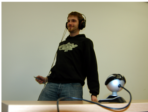
(b) In Action.