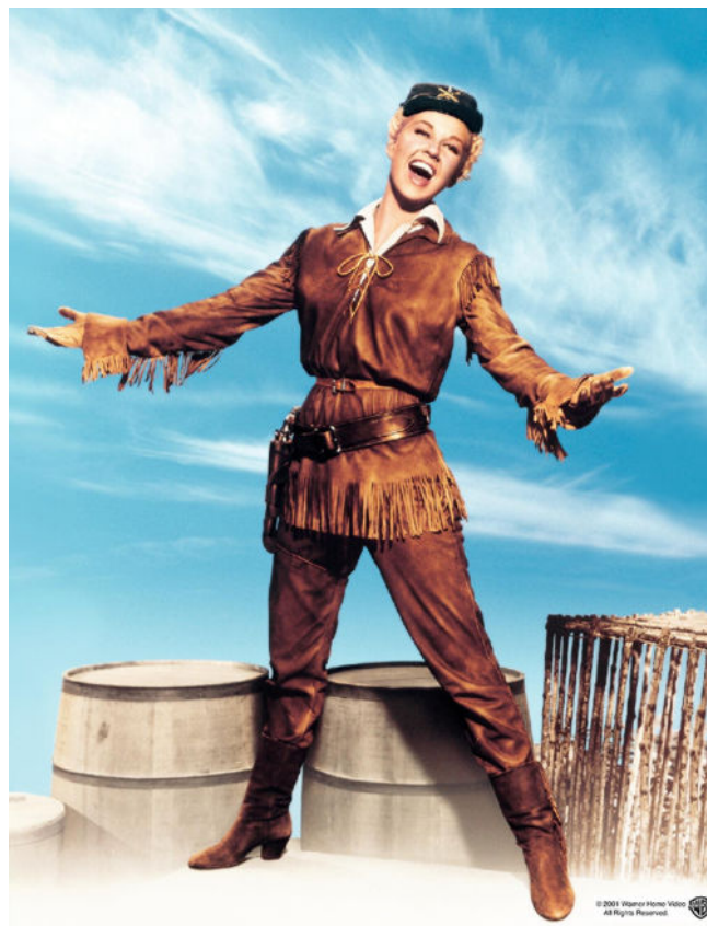
Figure 19: Doris Day's 'perky' Calamity Jane in buckskins