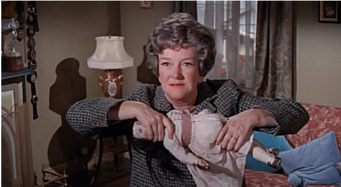
Figure 37: Beryl Reid in tweed blazer in The Killing of Sister George