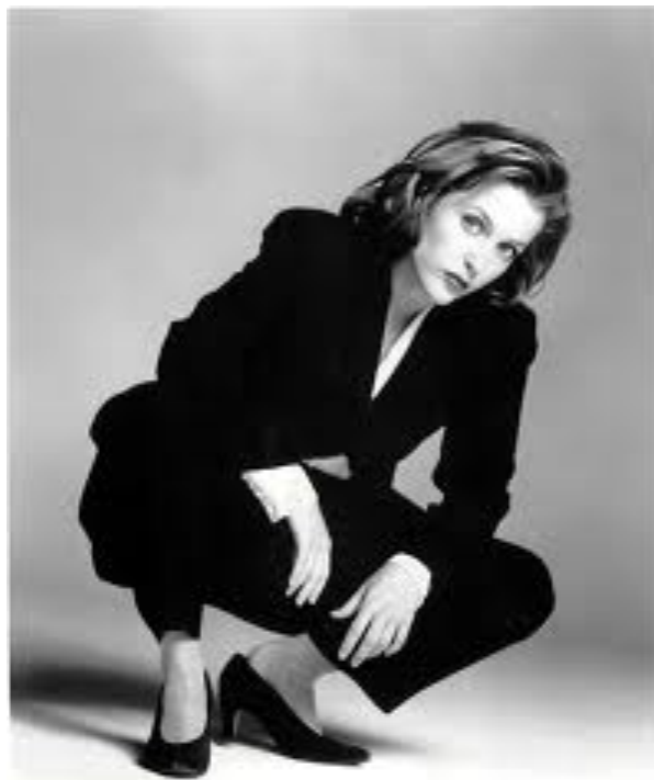
Figure 39: Gillian Anderson in a characteristic costume; promotional still for The X Files

Anderson) in The X Files (Fox, 1993-2002) (Fig.39) or the oft suited and stiletto-wearing Dean of Medicine and hospital administrator Dr. Lisa Cuddy (Lisa Edelstein) (Fig. 40) in House , a stickler for rule-following who frequently collides with the irreverent Dr. Gregory House (Hugh Laurie). The blazer as specifically 'scholarly' harks back to designs for phonetics scholar Professor Henry Higgins (Rex Harrison) in his formal suits in My Fair Lady (George Cukor, CBS/Warner Bros., USA, 1964) (Fig.41) and in particular the blend of smart and casual recalls the costuming of Michael Caine as Dr. Frank Bryant, a lecturer in English Literature in Educating Rita (Lewis Gilbert, Acorn Pictures, UK, 1983), first seen walking across the university quadrangle in a brown blazer with a white shirt unbuttoned at the neck and no tie, teamed with green trousers (see Fig.42). Vivian in Desert Hearts provides another example, with her 1950s inflected pale lavender skirt suit, paired with a respectable-looking hat to emphasise her initially prim characterisation (Fig. 5).