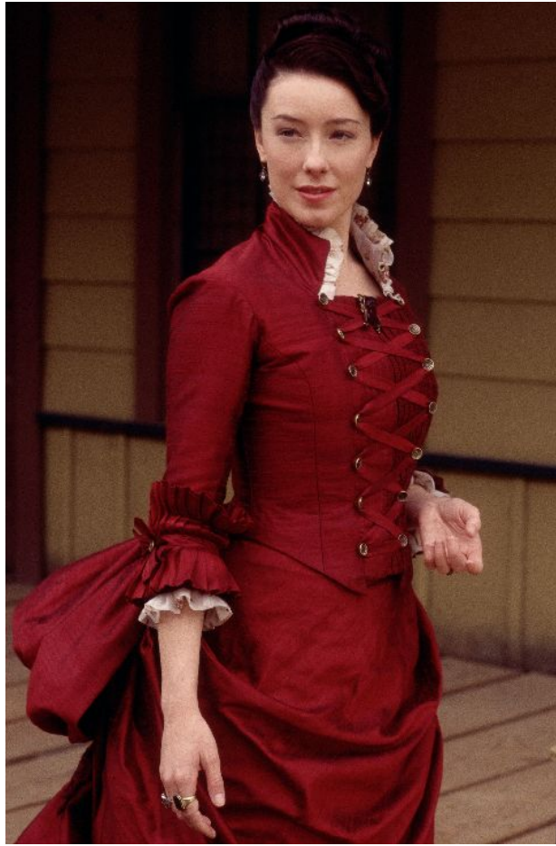
Figure 26: Deadwood's Alma Garrett