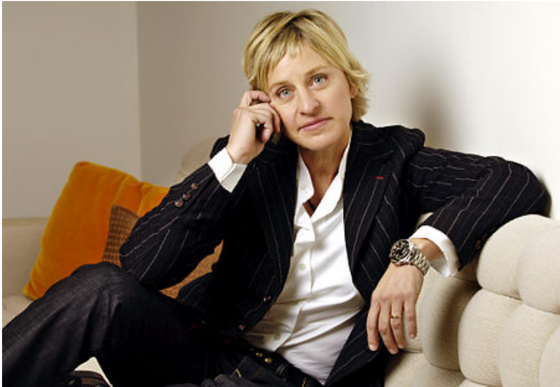
Figure 3: Ellen DeGeneres in jeans, button-up shirt and blazer.

whether through apologetic justification or feminised alteration, in order to be deemed acceptable within mainstream Western media in the 1990s.