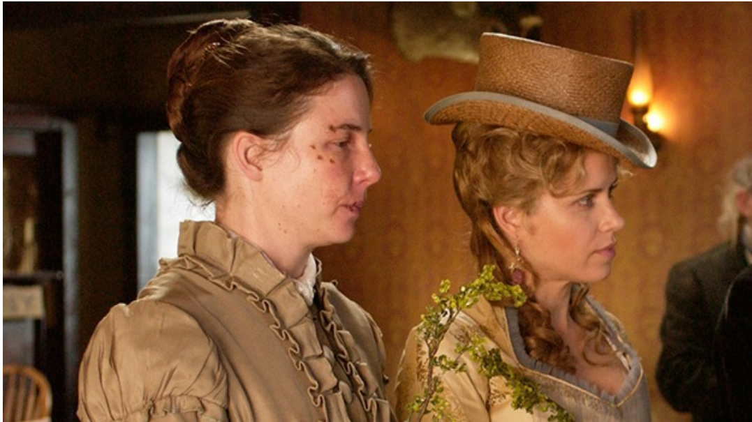
Figure 25: Deadwood 's Jane (l) in a dress, with Joanie Stubbs (r)