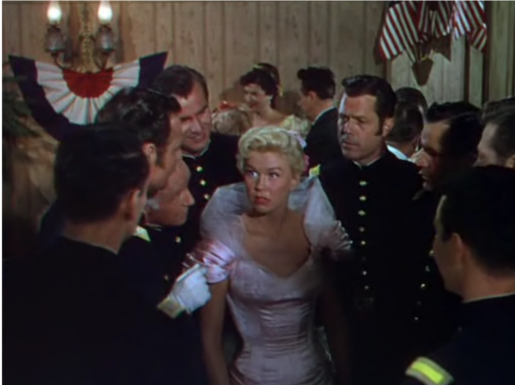
Figure 24: Doris Day as Calamity Jane attracting male attention in a dress

approved by one (unfortunate) onlooker, but it inspires no heterosexual coupling, in fact forming part of Jane and Joanie's slow, awkward courtship.