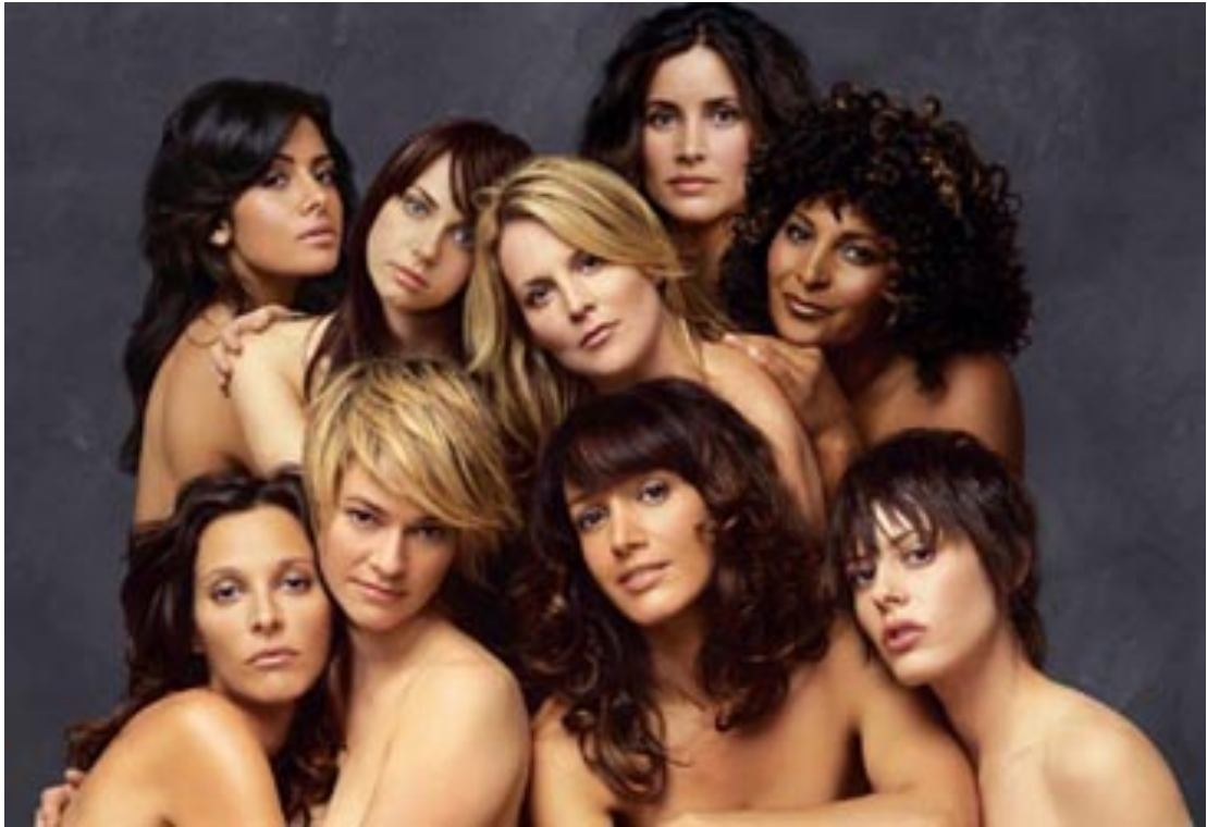
Figure 6: The L Word nude promotional campaign

The 'gay type' to which Dyer refers is not the ultra-glamorous figure of the lipstick lesbian as portrayed by The L Word . Similarly, the images mentioned are not production stills but promotional photo-shoots. Still, Dyer's argument seems applicable here. As the most public-facing images of the show, designed to sell the show to new or returning viewers, the photographs are significant, representing the impression the producers wished to convey to the world about their series and the lesbians featured within it. The promotional posters summed up the women of The L Word as sexy in a mainstream, heterocentric idealisation of women. Firstly, these types of images reflect 'norms' of mainstream U.S television which see female law enforcement officers or women whose characters have similarly practical professions running and fighting in tight clothing and high-heeled shoes, with just one example being Megan Hunt (Dana Delaney), a forensic pathologist in Body of Proof (ABC, USA, 2011- ), climbing down muddy embankments to take a look at a murder crime scenes, and performing autopsies—for which she would presumably be required to stand for hours—