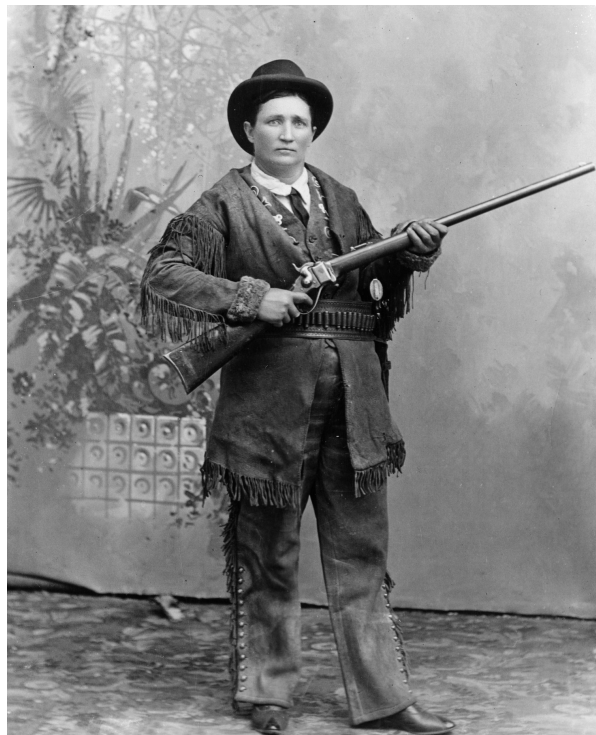
Figure 23: Martha Jane Canary, the real Calamity Jane