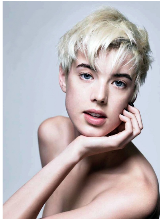
Figure 13: Agyness Deyn

trendy 'style' as opposed to Sam's more plain image) could be incorporated without straying from the impulse to maximise viewing figures by aiming for audience identification beyond a niche lesbian market. The result may have backfired when it came to creating looks that would be read as 'authentic'.