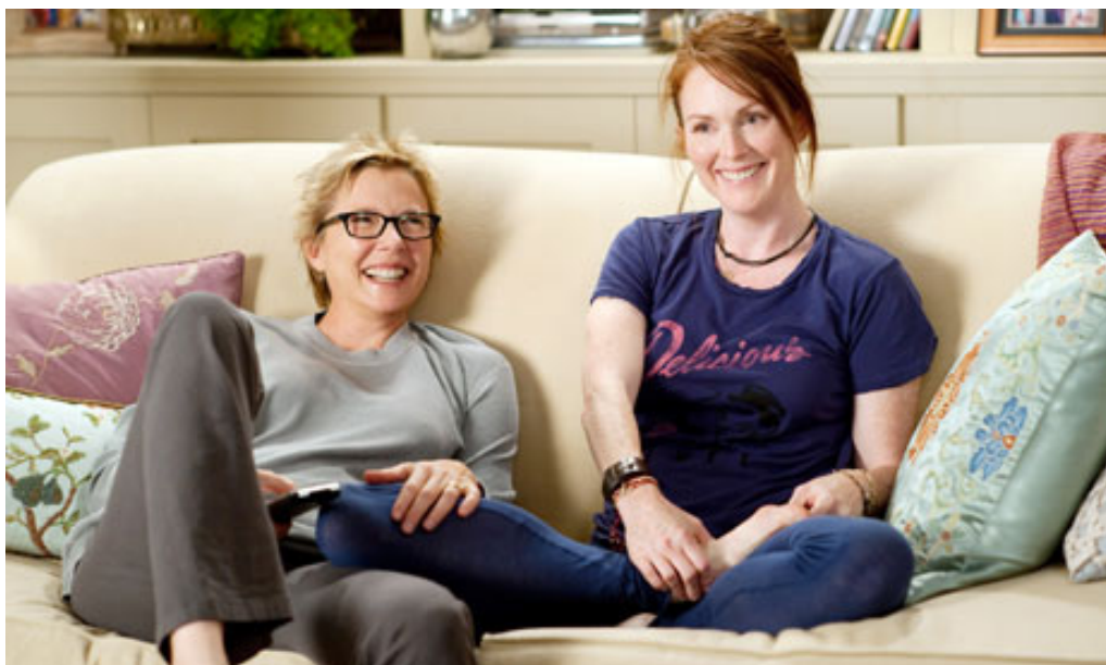
Figure 55: Bening and Moore in The Kids Are All Right