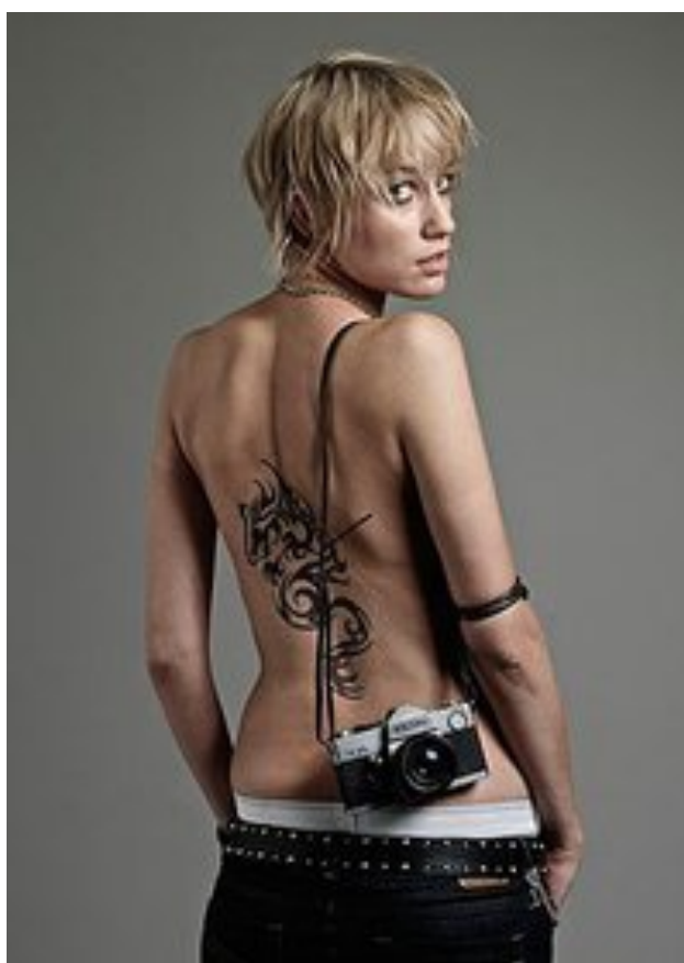
Figure 10: Frankie from Lip Service