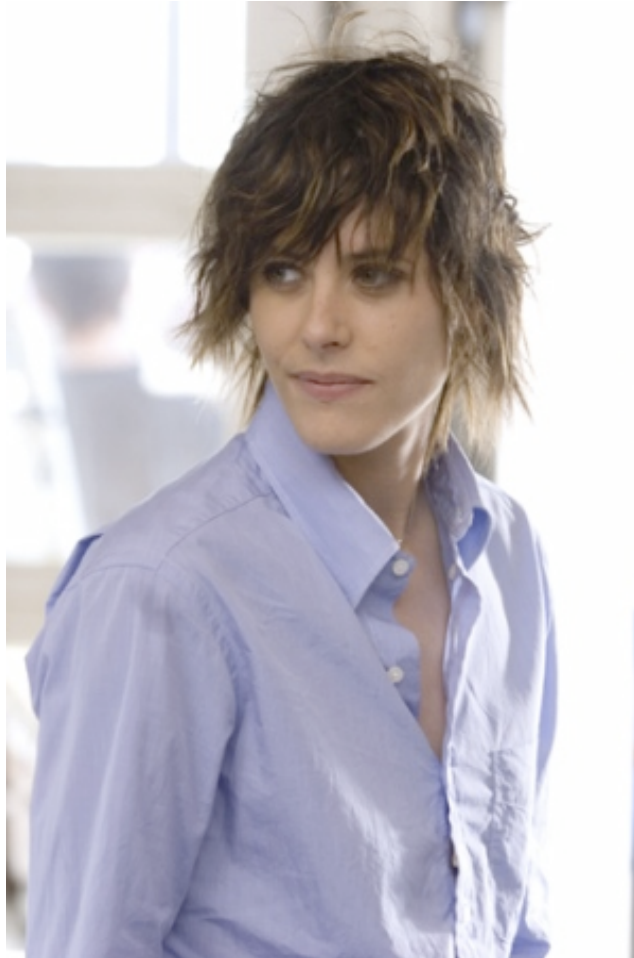
Figure 4: The L Word 's Shane (Katherine Moennig)

characters both problematically frames butch identities as less valid and therefore less acceptable than their femme counterparts and robs lesbianism of the political undertones present in the image of the recognisable lesbian. On a show about a number of lesbians, created by an out lesbian (show-runner Ilene Chaiken), this seemed like a disappointing sell out.