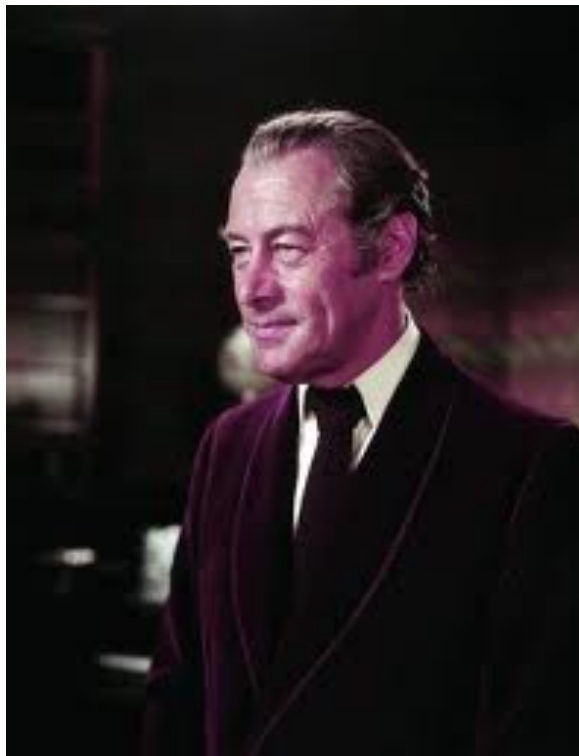
Figure 41: Rex Harrison as Professor Higgins in My Fair Lady