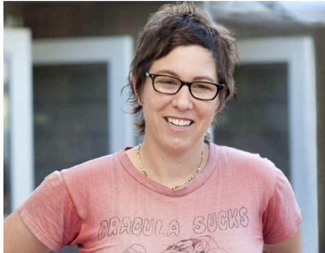
Figure 52: Lisa Cholodenko in T-shirt