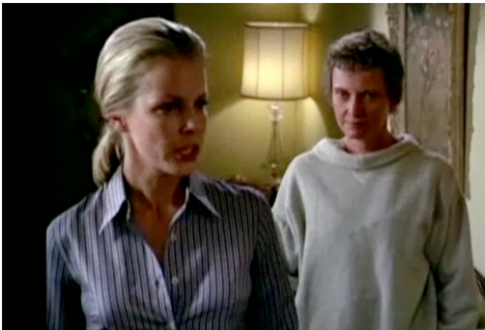
Figure 2: Gladys (Laraine Stephens) and Mame (Fay Spain) in 'Flowers of Evil'