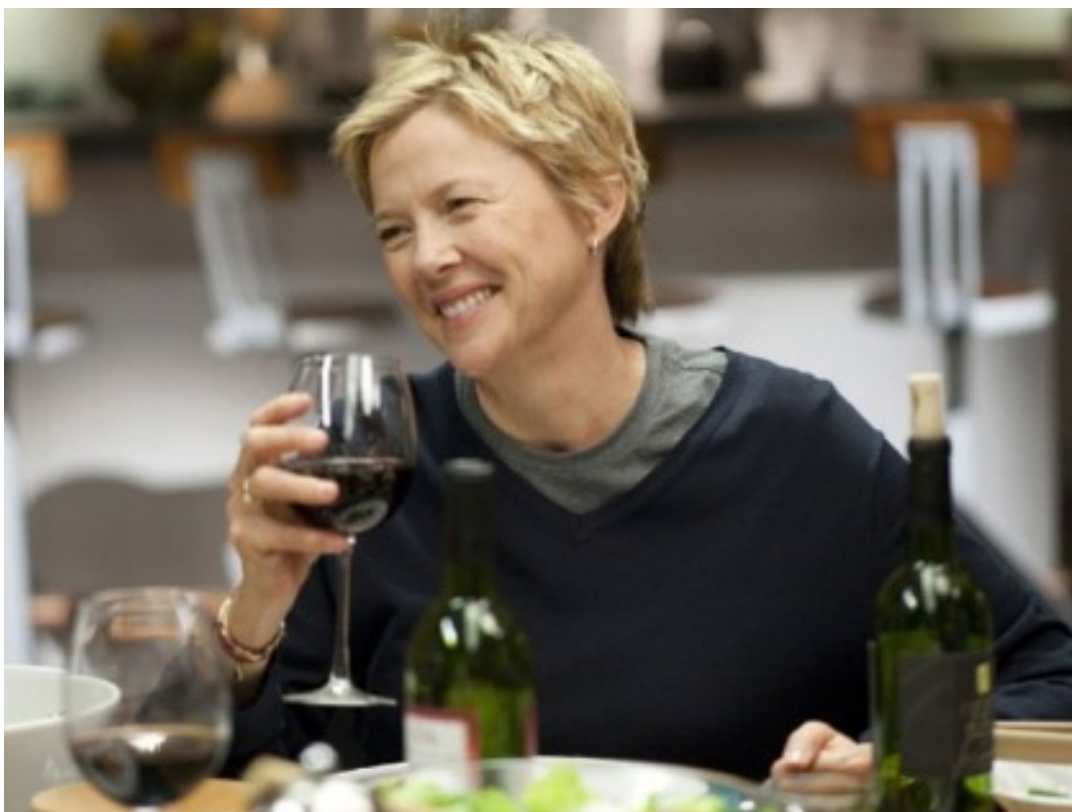
Figure 47: Bening in The Kids Are All Right

surroundings. The tunics appear to be influenced by Indian garments, suggesting a hippy-like personality with New Age and Hindu spiritual influences also hinted at by dialogue, as when Nic teases Jules that if Jules were in charge of thank you notes, the children would only send out ‘good vibes.’