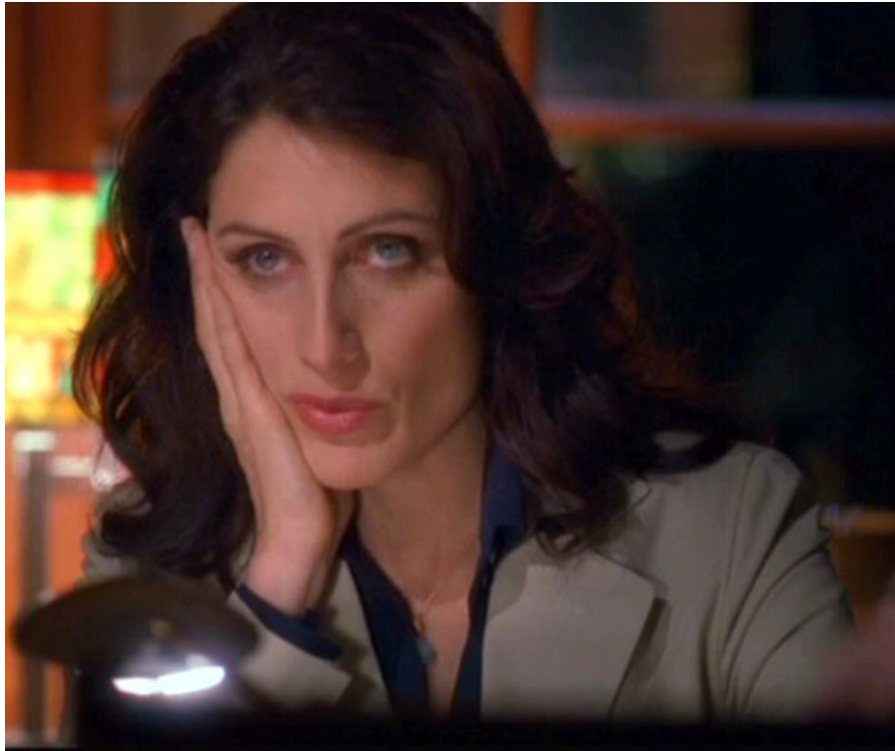
Figure 40: Lisa Edelstein as Dr. Cuddy in suit jacket and dress shirt in House