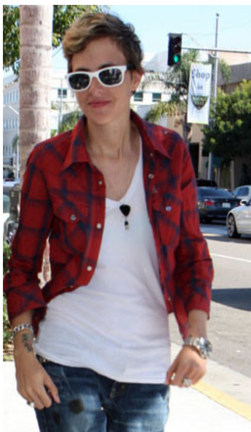
Figure 14: Samantha Ronson