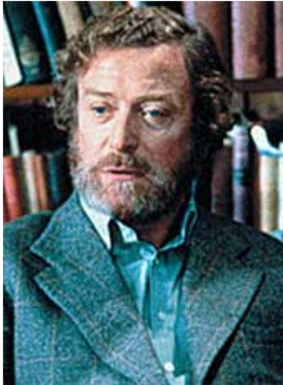
Figure 42: Michael Caine as Dr. Bryant in Educating Rita