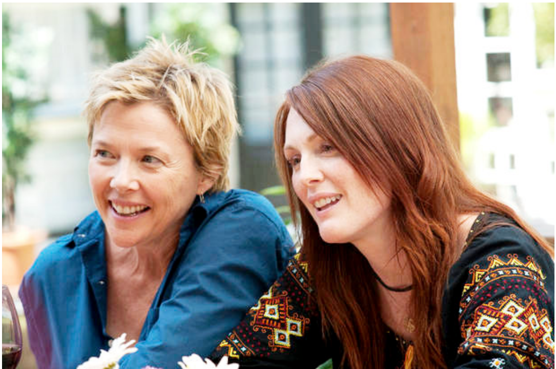
Figure 50: 'Photograph eight'; Bening and Moore in The Kids Are All Right