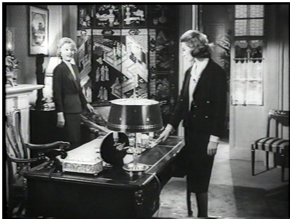
Figure 43: Barbara Stanwyck (left) in tight suit in Walk on the Wild Side

Side (Fig. 43) and Beryl Reid's butch blazer as the eponymous character in The Killing of Sister George . 195