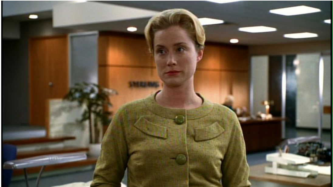
Figure 30: Carol's first appearance in Mad Men