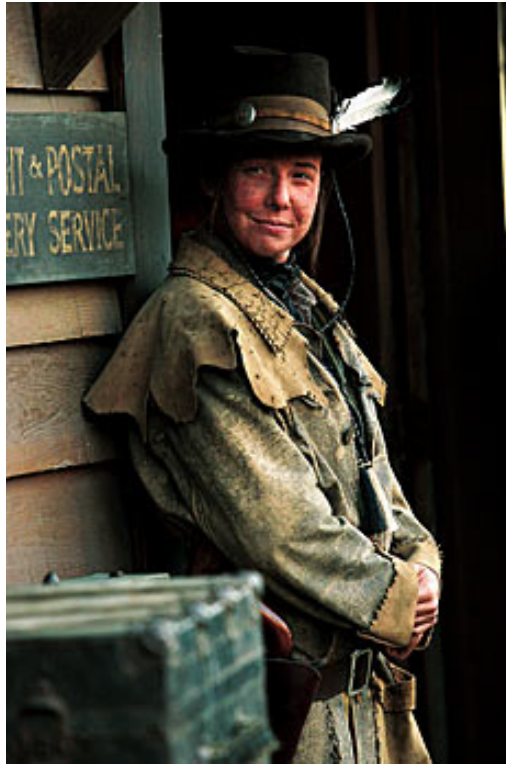
Figure 20: Deadwood's Jane in buckskins