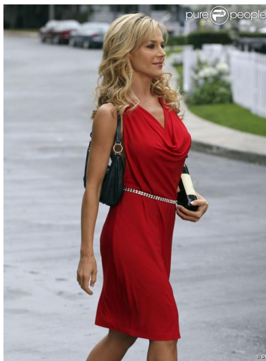
Figure 18: Robin on Wisteria Lane

'Women with long hair, they do look more feminine' before adding that she feels feminine women do not look like lesbians. 43