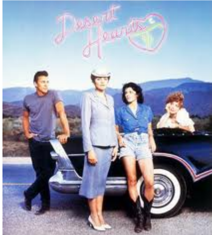
Figure 5: The women of Desert Hearts . Helen Shaver (centre left), Patricia Charbonneau (centre right)

costumed and shot the film, the director recuperated the potentially controversial subject matter, rendering it unchallenging to mass audience tastes. 67