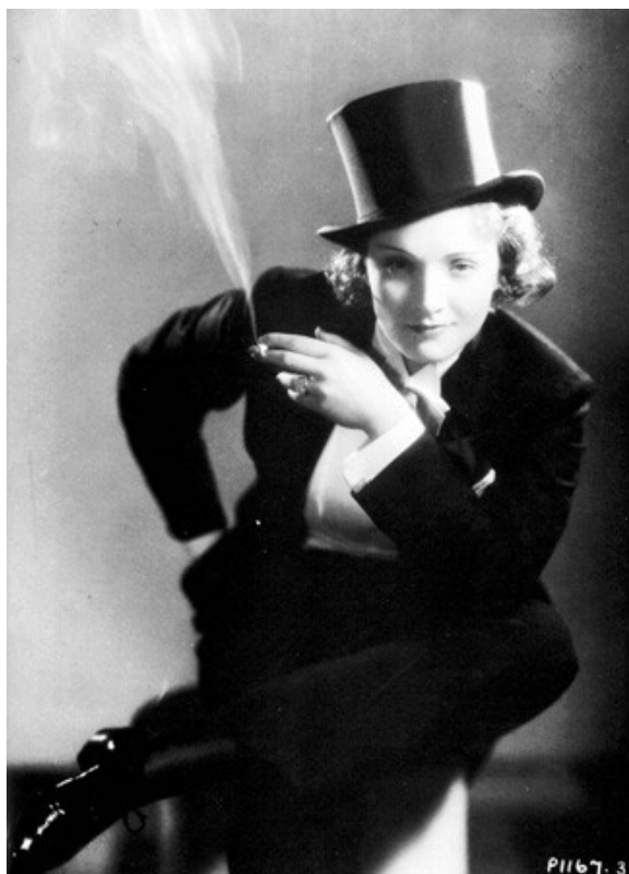
Figure 29: Marlene Dietrich wearing a top hat in promotional image for Morocco

through our collective imagination so that many might read Joanie's signature accessory as a historically lesbian signifier, with no need for any knowledge of either the origins in 1920s Parisian lesbian subculture or recognition of the fact that the fictional action of Deadwood technically precedes this.