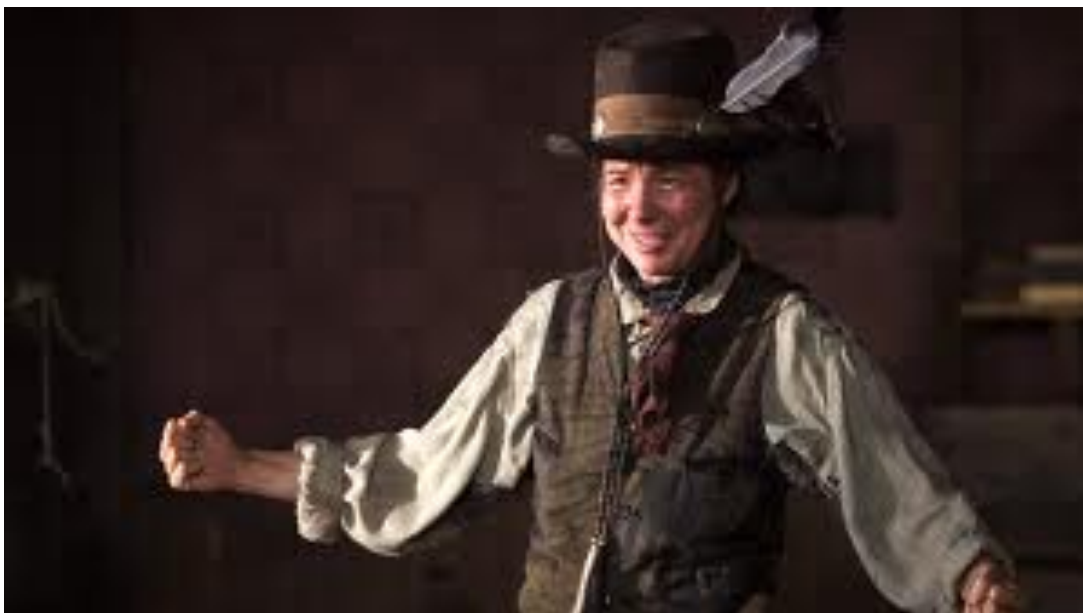
Figure 21: Deadwood's Jane in shirt, waistcoat and hat

towards this by keeping the character's clothes 'incredibly distressed and dirtied all the time', particularly the union suit. 77