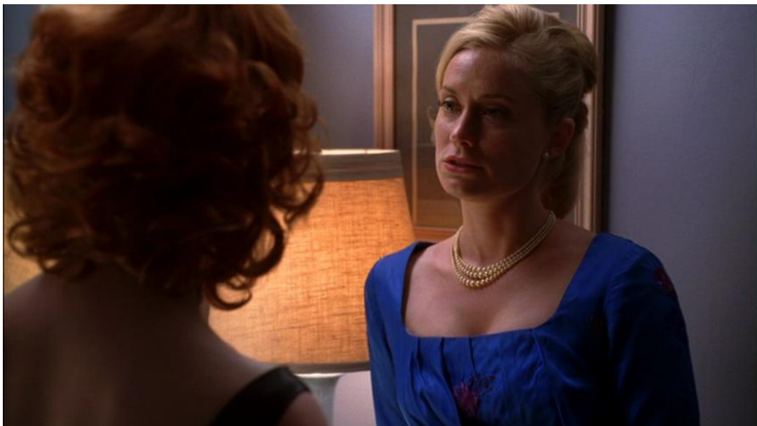
Figure 34: Carol confesses her love for Joan in 'The Long Weekend'