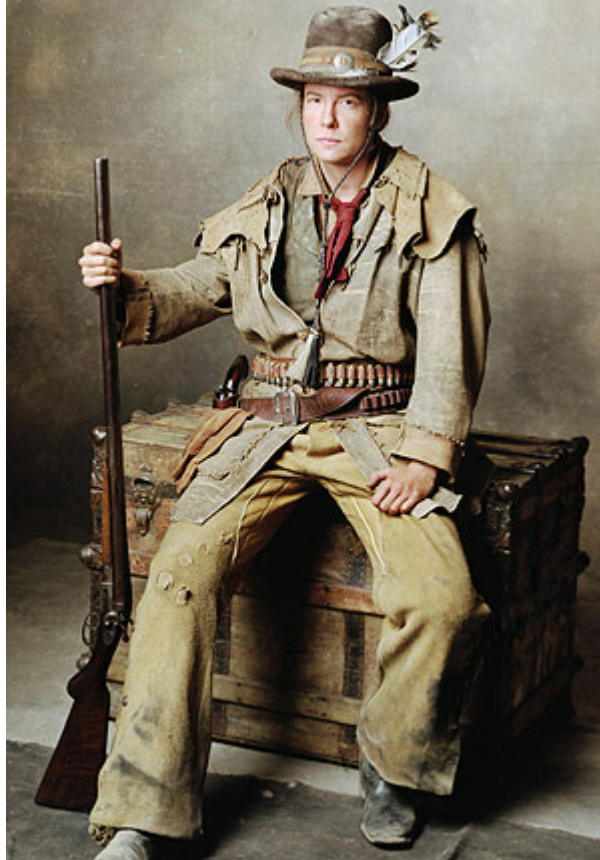
Figure 22: Robin Weigert in promotional image for Deadwood

femininity. Jane's appearance is so manly as to cause hotel owner E.B Farnum (William Sanderson) to qualify his address to her as 'Madam' by deliberately looking her up and down, pointedly adding 'If I guess your sex correct.' 79