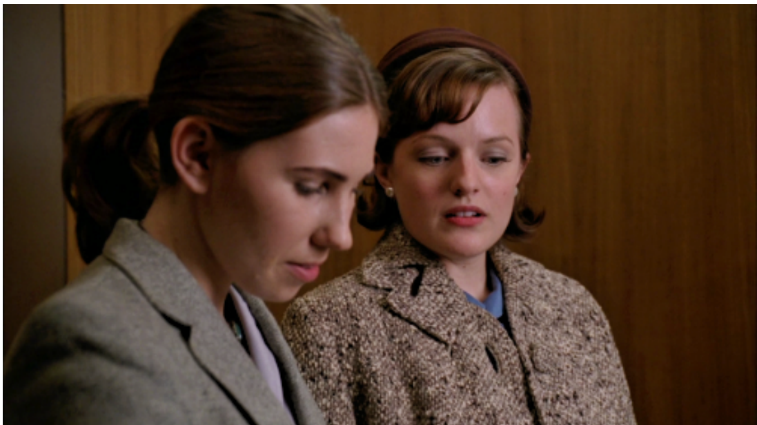
Figure 31: Joyce's first appearance in Mad Men (left)

about. 131 Opening in March 1960 and currently having covered up to April 1967, Mad Men is a series highly concerned with the effect of social and political change on individuals, viewed from the knowing perspective of the modern day audience member. While there is a primary focus on the reactions characters have to events in their own lives, the social upheaval that characterised the 1960s in the US—with the civil rights movement and the beginning of women's liberation—has made shifting social realities an increasingly noticeable factor in the characters' lives on the series as the years progress. As the youth culture grows and various causes gain headway, the creative personnel at Sterling Cooper alter their campaigns and working models, hiring Peggy away from her secretarial job to become a copywriter in the second season and forced to employ an African American woman to work as a secretary in 'Tea Leaves'.