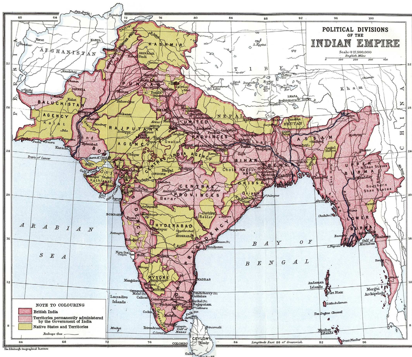
Fig. 3. Political Divisions of the Indian Empire, c. 1916, downloaded from http://www.gutenberg.org/files/20583/20583-h/20583-h.htm . The map is the frontispiece to R.V. Russell, The Tribes and Castes of the Central Provinces of India , London, 1916; it was adapted from the Imperial Gazetteer of India: Atlas , Vol. 26, Oxford, 1909, map 20.

the Princely States, and in the imperial policy of indirect rule more generally. 113 Yet this left the problem of how to encourage ‘development’, and to exert control, in these spaces. Sir Charles Lewis Tupper, drawing on Maine, argued in the 1890s that the Princely States should be exempt from international law and be governed by officially determined law (that is ‘political’ not ‘diplomatic’ law) based upon the doctrines of divisible sovereignty and usage. But this determination would be relating to decisions based on British precedent, not on general rules. This established, as Benton put it, ‘indeterminacy as policy’. 114 While Benton’s studies conclude in 1900, this policy was very much taken forward into the Prince’s almost-international life in the interwar period.