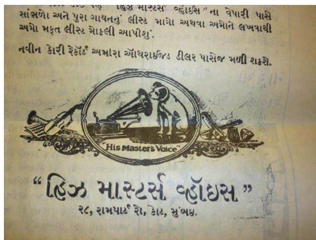
Fig. 1. A HMV advert from the newspaper Kaisar-i-Hind , 24 July 1932.

born Indian nationalist sympathiser C.F. Andrews who asked: 'is India, with all her great traditions of the past and her vast economic and industrial importance in the world to-day, to be treated as a mere cipher? Can she not even speak with her own voice?'. 70 Andrews had not understood this 'anomaly' until he read an article explaining India's exceptional status in the League which made it unable to contract and honour international obligations freely.