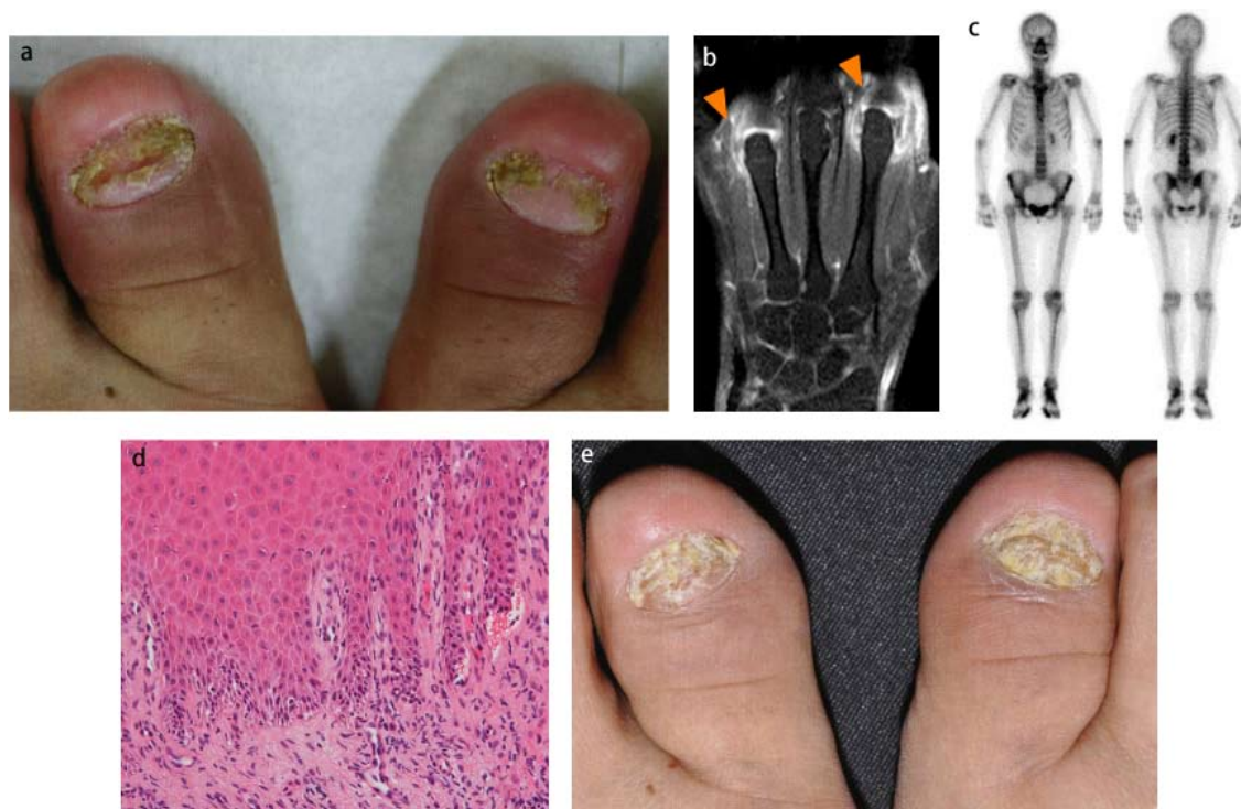
Figure 2. (a) Clinical features: nail destruction with paronychia erythema on the bilateral big toes; (b) magnetic resonance imaging: arrows show synovitis in metatarsophalangeal joints; (c) bone scintigraphy showing multiple uptakes; asymmetric involvement of the distal and proximal interphalangeal joints; (d) histopathologic findings of erythema on the big toes: elongation of rete ridges with exocytosis of neutrophils and lymphocytes HE; x200; (e) clinical feature: improvement of skin manifestation after the administration of salazosulfapyridine with topical tacrolimus.

ously, reddish eruptions had not appeared except for acral regions. Examination showed yellowish-white discolored nails with atrophy in the bilateral big toes and erythema in the paronychia regions (Fig. 2a). Purulent discharge was seen from the subungual space and the surrounding erythema. Routine hematologic and immunologic examinations were normal except for an increase in antinuclear antibody, \times 160 . Fungal and bacterial cultures from the pustules and nails were negative. While bone x-rays showed no abnormalities, magnetic resonance imaging revealed synovitis in the metatarsophalangeal joints of the left index and ring fingers (Fig. 2b). In addition, bone scintigraphy indicated increased uptakes in multiple joints (Fig. 2c). A biopsy from the toe skin showed elongation of rete ridges as well as dermal infiltration of neutrophils and lymphocytes, extending to the epidermis (Fig. 2d). The patient was treated with oral salazosulfapyridine 1000 mg daily as well as an occlusive dressing of tacrolimus ointment, which alleviated the cutaneous and joint symptoms (Fig. 2e).