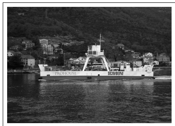
Figure 1 - Ferryboat "KAMENARI"

or maintenance of transport means, will be exposed to increased level of noise [2]. A typical example are employees who perform their work activities as sailors on ferryboats for transport of people and vehicles. In this particular case, it is about employees who work as "sailors" on ferryboats owned by the company A.D. Pomorski saobraćaj - Kotor. Damage to hearing organs of employees who have been working as sailors for more than four years has been noticed through regular medical examinations of employees. Statistically speaking, the level of 5% of employees with reduced ability to detect sound signals does not represent a significant value and alarming data, but suggests the fact that it is necessary to do a risk analysis of increased noise exposure on a particular work position. An experiment has been conducted for this purpose, in which noise risk assessment has been carried out for sailors who work on "KAMENARI" ferryboat, which runs on Kamenari - Lepetane route. The ferry "Kamenari" was originally used as a navy artillery assault raft that in 1966 was adjusted for ferry service in the military shipyard "Arsenal". Regardless of the age of almost five decades, thanks to very good maintenance, this ferry is still being actively used (Figure 1).