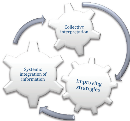
Figure 2 Strategic Learning Model

for the focus and choosing the right tools for learning about that element. This ensures that resources are not wasted in collecting information about something that may be interesting but is not useful in improving a strategy and its outcomes. This approach also emphasizes the use of a research base underlying the work. The research in this case drew from the public will-building framework developed by the Metropolitan Group (2009) and was reinforced by research on communications, mobilization, educating, and organizing.