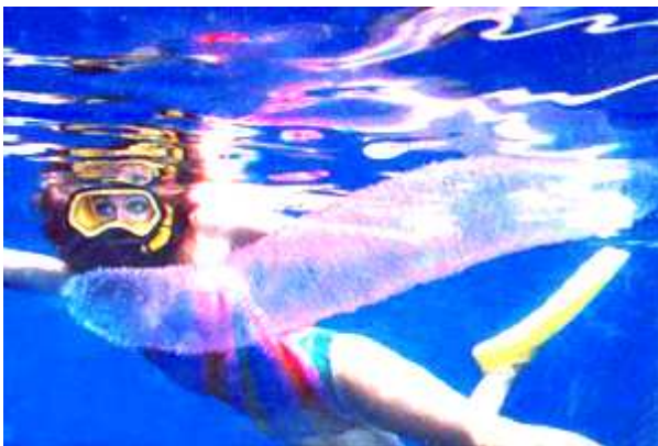
Figure 2. Egg Case of diamondback squid

We arranged to visit fishing villages with pictures of the egg case to locate the area where fishermen saw them. We limited our visits only to those villages where the 1,000m sea bed contour was close to the shore. These areas can be fished by their own small boat and may become financially feasible to practice squid fishing. We eliminated those areas where 1000m sea bed contour is far from shore because it would require a large amount of initial investment to start squid fishing even if good grounds were found. The area we selected was from Savanna-la-Mar in Westmoreland, going from that location westward around the westernmost tip of the island, then progressively eastwards along the north coast. We continued around the coast from Manchioneal, Portland in eastern Jamaica towards the southern coastline towards Kingston (See Figure 1). We eliminated ambiguous answers from fishers and ensured