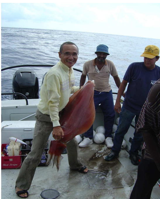
Figure 3. Second diamondback squid caught February 09, 2006.

Fishing Ground Position: Latitude N 17° 45.6', Longitude W 76° 31.1' (6 km off St. Thomas).