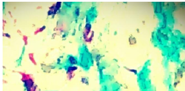
Figure 1: Rod shape Acid alcohol fast bacilli (arrow) in lymph node paraffin wax section by conventional Z.N method (x 100)

Figures 1 showed the rod shape acid-fast bacilli (arrow) in lymph node paraffin wax section by ZN classical method (x 100).