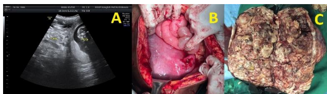
Figure 1: Ultrasonography and Macroscopy of Immature Teratoma Durante Operation. A. Left adnexal mass hypohyperechoic with size that cannot reach by the probe at 19 weeks 5 day GA; B. Uterus size corresponding with 18-20 weeks GA, left Fallopian tube normal, post-oophorectomy; C. Lobulated solid mass with multiseptate cystic inside it.

Thirty-one-year-old female, G2P1A0, 8 weeks 1 day GA, with solid ovarian tumour 15 x 15 x 15 cm in size. At 19 weeks 5-day GA, the tumour size became 30 x 30 x 30 cm, solid, rough surface, mobile, and painful. Tumour marker was raising, AFP 699.9 IU/mL and LDH 579 U/L. The patient had conservative primary surgery (left oophorectomy, omentectomy, and ascites fluid cytology). Midline incision performed, Durante operation evaluation with minimal uterus manipulation and seen solid mass 40 x 40 x 40 cm in size, rough surface, left ovary origin, omental attach then adhesiolysis done, rupture, and successfully removed. Internal abdominal organ evaluation: uterus corresponding 18-20 weeks GA, right and left Fallopian tube, right ovary, peritoneum, omentum, and liver normal. Histopathological concluded grade II immature teratoma of the left ovary with the neuroepithelial and fat immature component.