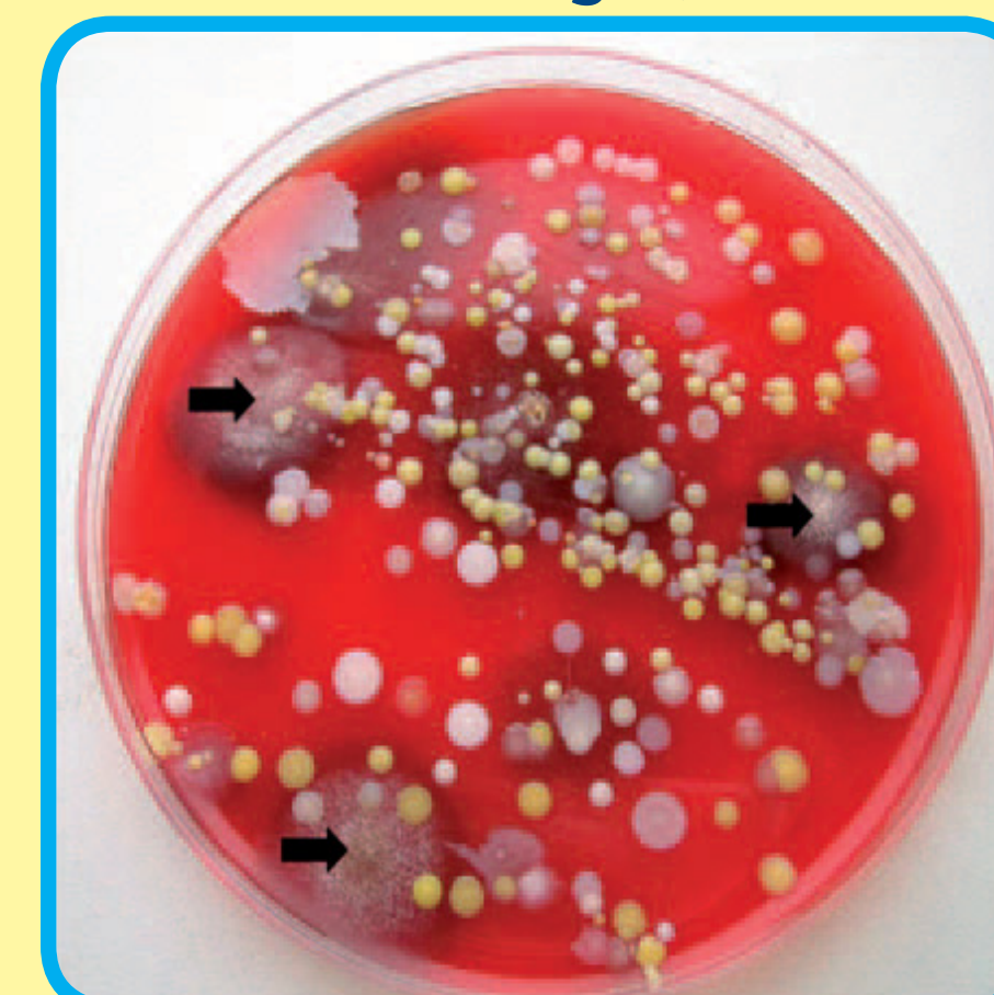
Arrows show fungal colonies