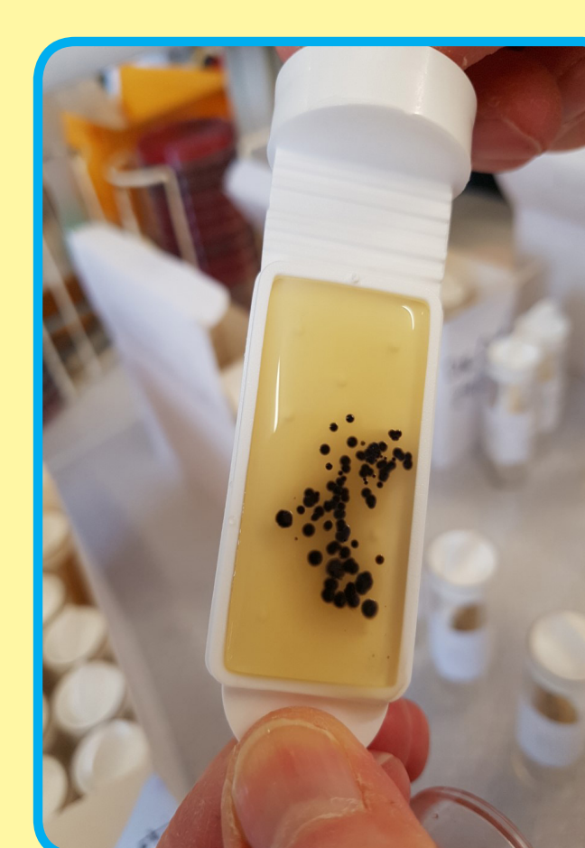
Figure 4: Staphylococci on Baird Parker agar from kettle handle