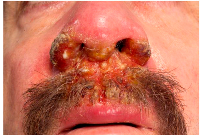
FIGURE 2. Case 3. Granulomatous lesions of mucosal leishmaniasis of nasal passages and surrounding skin. This figure appears in color at www.ajtmh.org .

Case 4. A 60-year-old woman was referred in May 2015 with a 4 month history of a hoarse voice and occasional fever. She recalled a previous skin lesion affecting the neck which had spontaneously healed which may have been localized CL. She had lived in southern Spain for the past 7 years. She had a 10-year history of asthma, for which she