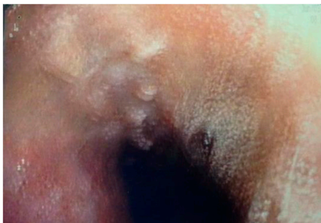
FIGURE 1. Case 2. Nodular appearance of trachea on bronchoscopy, due to mucosal leishmaniasis. This figure appears in color at www.ajtmh.org .

Case 5. A 54-year-old woman was referred in February 2016 with a 3-month history of a hoarse voice, cough, and choking episodes. She had a history of a previous crusted ulcer on her leg, which spontaneously healed 8 years prior to presentation. She had lived for periods in a rural area of Greece for the previous 11 years. She has had a past medical history of emphysema for 15 years for which she had received numerous courses of mainly inhaled but also systemic corticosteroids.