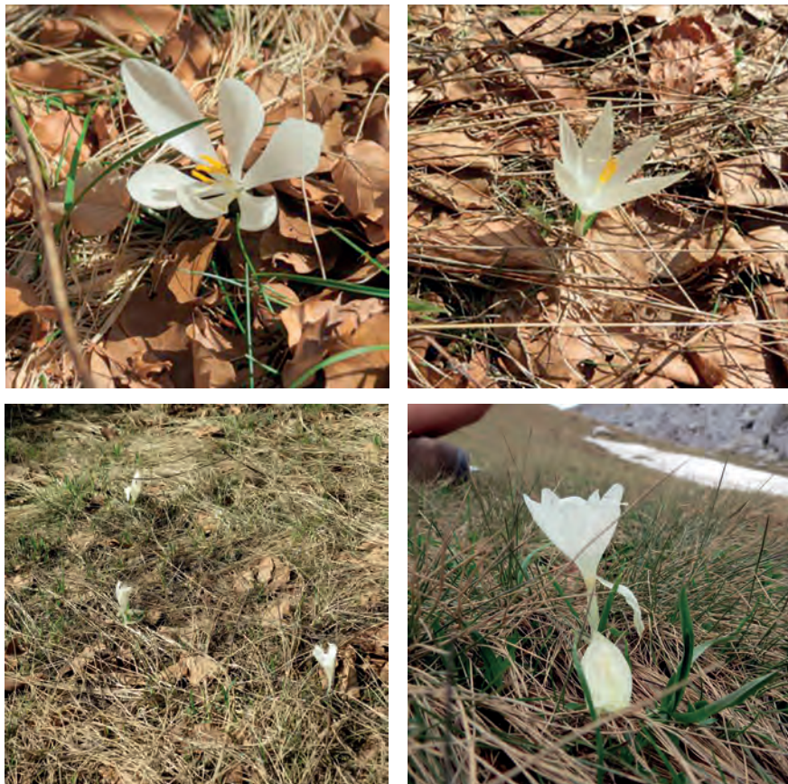
Figure 8. Crocus jablanicensis .

RANDELOVIC et al. (2012). They have found it on Jablanica Mt. in the western part of Macedonia. It has white style, stigma and perianth throat. This taxon is not in Albanian Flora.