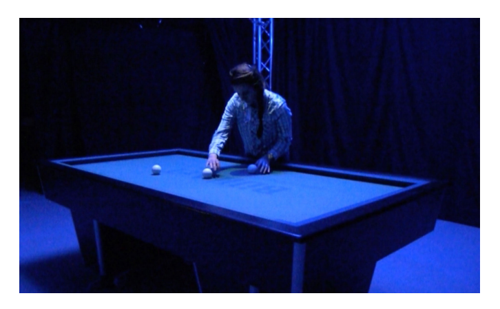
Fig. 1. Participant interacting with BilliArT.

The installation represents a unique case study for scientific investigation because it was specifically designed to be an artistic work as well as a measuring tool. It is a broad idea, but practically it means that the installation allows for an experimental setup to be built around it, by fulfilling a list of requirements: for example, the size of the system must fit in the lab; the duration of the interaction must allow observation without being hours long, and of course the laboratory paraphernalia must not interfere with the artistic experience of the system. In this sense, the close collaboration of the artist has been valuable and necessary. Nobody else can have the authority to judge about the impact that a small decision can have on the desired effect of the installation - unless mandated by the artist himself. Getting the artists personally involved is generally a great asset to the project (Guggenheim 2003), but it's not always possible (for reasons including geographical distance, overbooking, unavailability, lack of interest, untimely passing, etc.). In our case, not only did the artist participate in the experimental design, but helped with the planning of the data collection and analysis thanks to his in-depth knowledge of the technical setup of the installation. For a detailed description of the technical setup, see Vets et al. 2017; in the next Section we present a concise description of how the installation works.