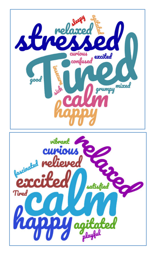
Fig. 4. Word clouds expressing the mood of the participants before (top) and after (bottom) the game.

The trend in the transition from before to after the game stands out as positive for both groups, although in slightly different ways because the starting situation was different. Females showed a pronounced negative state before the game, and used more words than males to describe it. After the game, the mood of females increased significantly (7 different negative words before the game, for a total of 15 recurrences, and only 2 words after the game, each recurring once). While males also showed a decrease in the negative words (from 2 to 1), but in their case it is the positive words that increase in variety (5 different positive words before the game, for a total of 7 recurrences, and 8 words after the game, recurring 10 times). In our estimation, the increase in the variety of words should be regarded as a positive indicator because the richness of the experienced inner state evokes a greater variety of adjectives to describe it. Targeted future studies might address the question whether there is a connection between a session (about 10 minutes) of interacting with an artistic installation (which is expected to stimulate curiosity and creativity) and an (even temporary) increased capacity to feel and to perceive