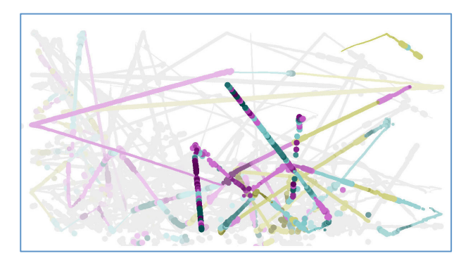
Fig. 2. Graphical reconstruction of the balls trajectories using the motion capture data log.

There was some intentional redundancy in the data, aimed at integrating eventual missing data (which was not necessary) and at the verification of the consistency of the data. For example, the balls trajectories were graphically reconstructed starting from the motion capture data log (Fig. 2) and superimposed to the video recording captured from the top of the table (to see how much noise was recorded by the motion capture system in the trajectories of the balls).