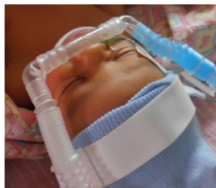
Figure 1 Bubble continuous positive airway pressure (bCPAP) set-up.

'4-2-1 rule' 29 were administered. Isotonic electrolyte solutions (Ringers lactate and dextrose) 30 were used as maintenance fluids. Once vital organ functions were stabilised, 3-hourly NGT feeds were introduced gradually with expressed breast milk for infants, F-75 for children >6 months with SAM. Regarding enteral nutrition of critically ill children without severe acute malnutrition (SAM): Not enough therapeutic nutrition (F75 or F100) was available for the nutrition of critically ill children without SAM. No other specific enteral nutrition was available for this purpose. Therefore ordinary milk products or porridge were used for gastric tube feeding of these critically ill children. In many cases, tolerance of enteral feeds was initially tested with the administration of oral rehydration fluids via NGTs. The maximum volume of enteral feeds administered during this 'critical care phase' for malnourished and non-malnourished children was 100% according to the '4-2-1 rule' 29 .