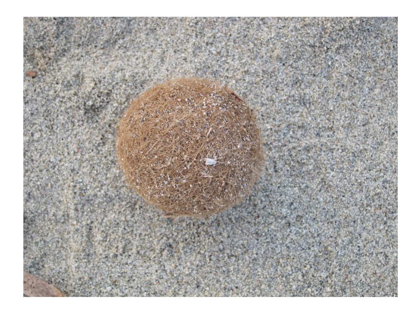
Fig 4: Ball of Posidonia on San Foca beach, March 2017, photo: Andrew Barry.

Our argument proceeds in three stages. First, we review the existing literature on the subterranean and the subaquatic. We consider the strengths and limitations of approaches that conceive of the subsurface as a 'volume' as well as those that focus on the liveliness of materials, and we advance a series of new arguments. Second, we discuss the relation between the TAP controversy and tendencies in Italian government and politics in the period prior to 2017. We interrogate how and why the subaquatic came to matter politically in this particular case, and dwell on why the pipeline came to be constructed at this location on the Adriatic coast. Third, we address how the relation between TAP and the disparate organisms and materials of the subsurface came to be mediated and supplemented by scientific, legal and political practices. As we contend,