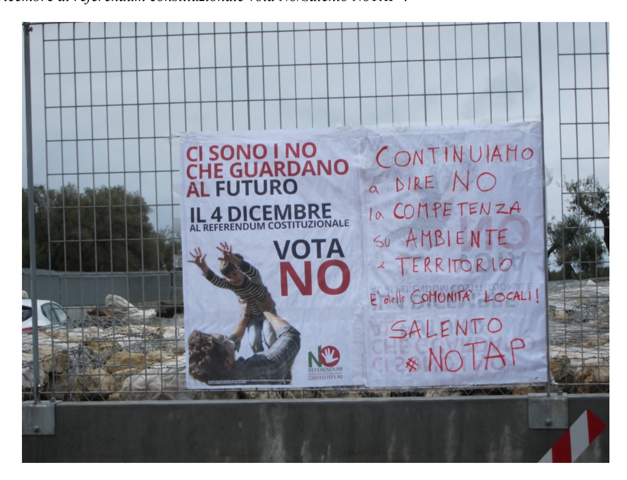
Figure 5. 'Il 4 Dicembre al referendum constituzionale vota No/Salento NoTAP', Melendugno, April 2017, photo: Andrew Barry.

government (Salvati 2016) and, in particular, to Renzi's proposed constitutional reforms – which threatened to significantly limit the role of the regions in the development of energy infrastructures, including TAP (Italy nd). Indeed the NoTAP committee, initially formed just by representatives of the municipality of Melendugno, had progressively drawn together a coalition of local mayors from across the political spectrum, who articulated the explicit opposition of the entire Salento region to the pipeline project. Following the removal of olive trees in the week after the NoTAP rally in San Foca, a poster for the campaign against Renzi's reform appeared on the wire mesh security fence that surrounded the pipeline construction site, a hand-written injunction that made the link between opposition to constitutional reform and opposition to TAP explicit: 'Il 4 Dicembre al referendum constituzionale vota No/Salento NoTAP':