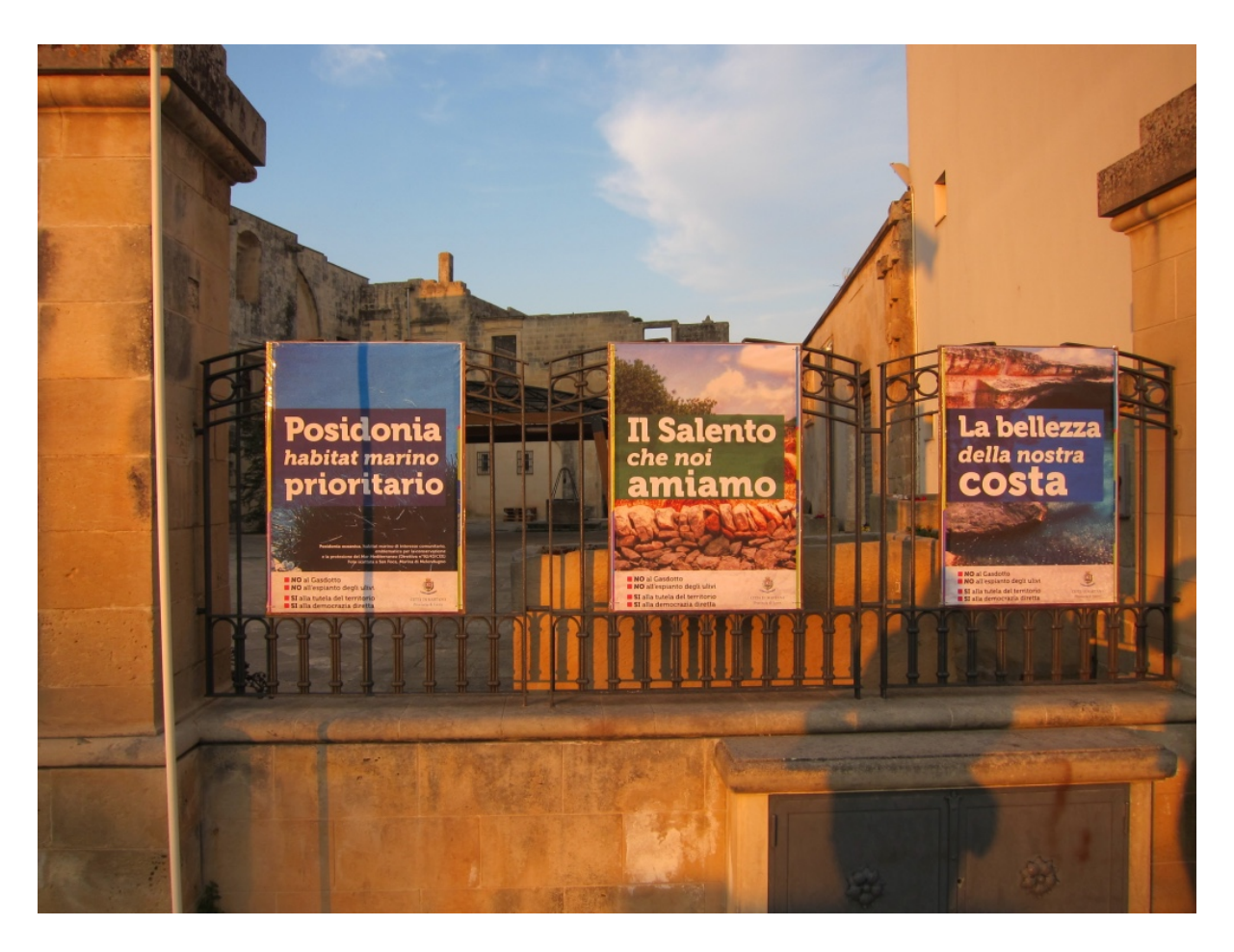
Fig 3: Posidonia habitat marino prioritario, Martano, Puglia, March 2017