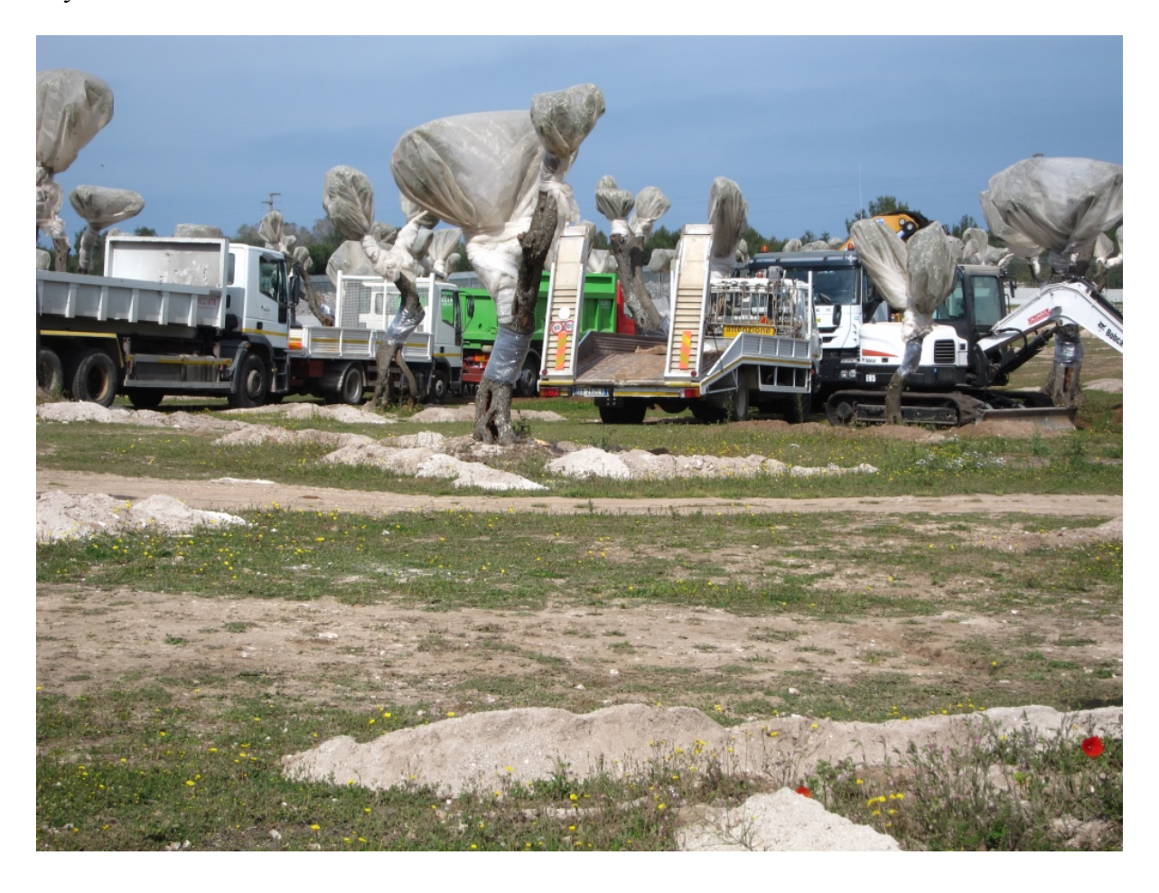
Fig 1: Wrapped olive trees, in the vicinity of Melendugno, April 2017, photo: Andrew Barry.

occupation of an ancient olive grove had occurred near the projected route of the pipeline. Widely reported in the national press, images of wrapped olive trees waiting to be removed in order to make it possible to begin construction, enclosed by security fences, made a striking contrast to the image of the small camp of protestors. During the rally, speakers advised those who could to support the occupation over the coming days.<sup>3</sup>